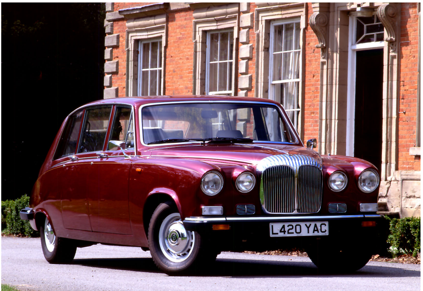
1994 Daimler Limo

Instagram www.instagram.com/jaguardaimlerheritage.trust