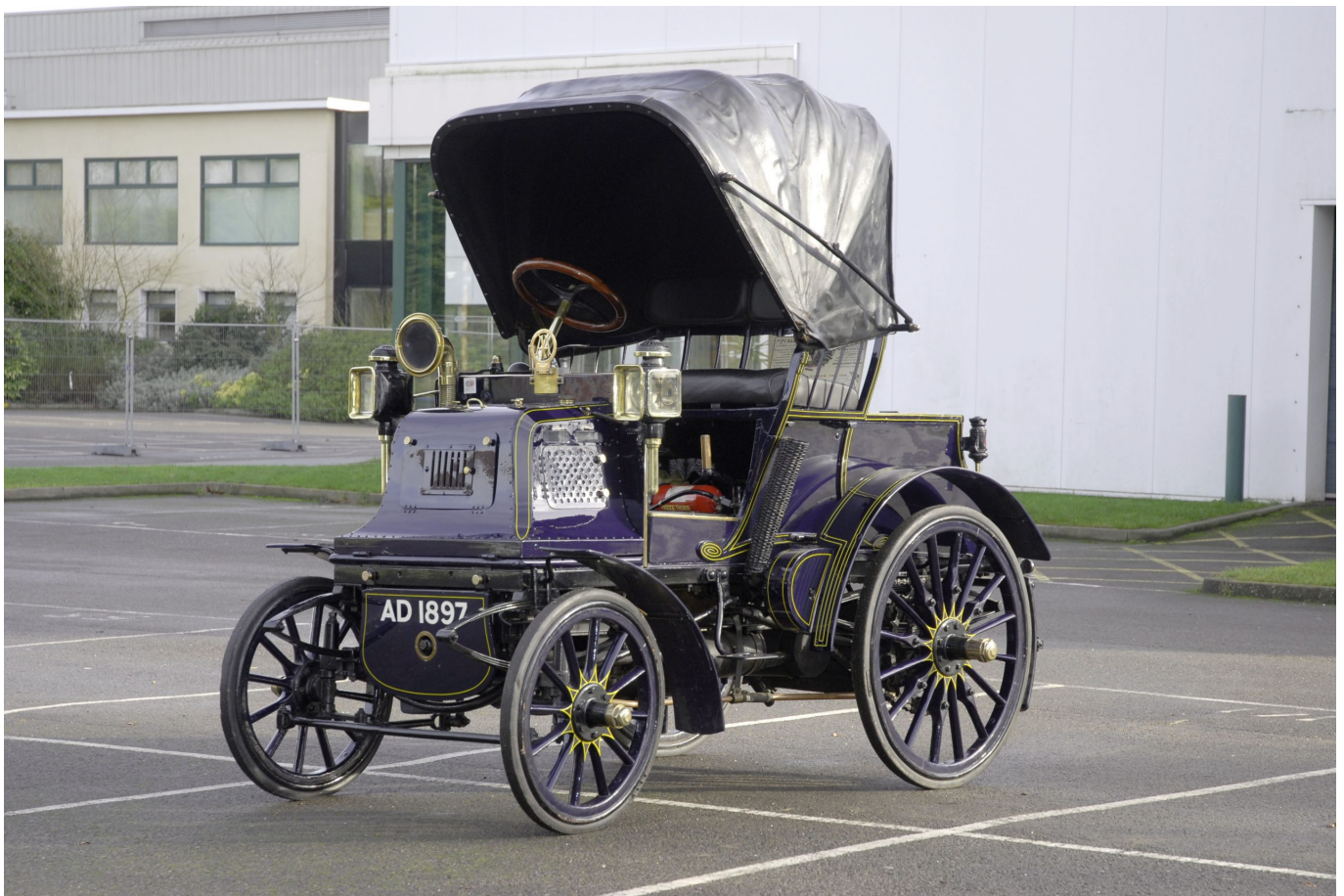
1897 Daimler Grafton Phaeton

Online version: https://www.wheels-alive.co.uk/when-jaguar-bought-daimler-new-exhibition-at-the-british-motor-museum/