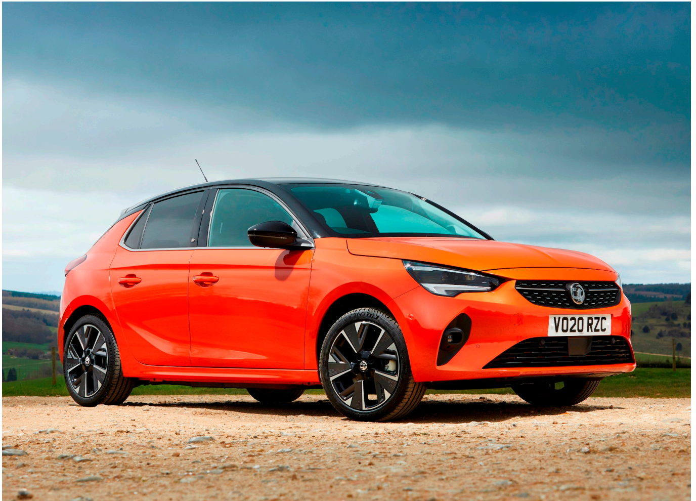
Vauxhall's latest Corsa - at No. 2 in the UK sales league.