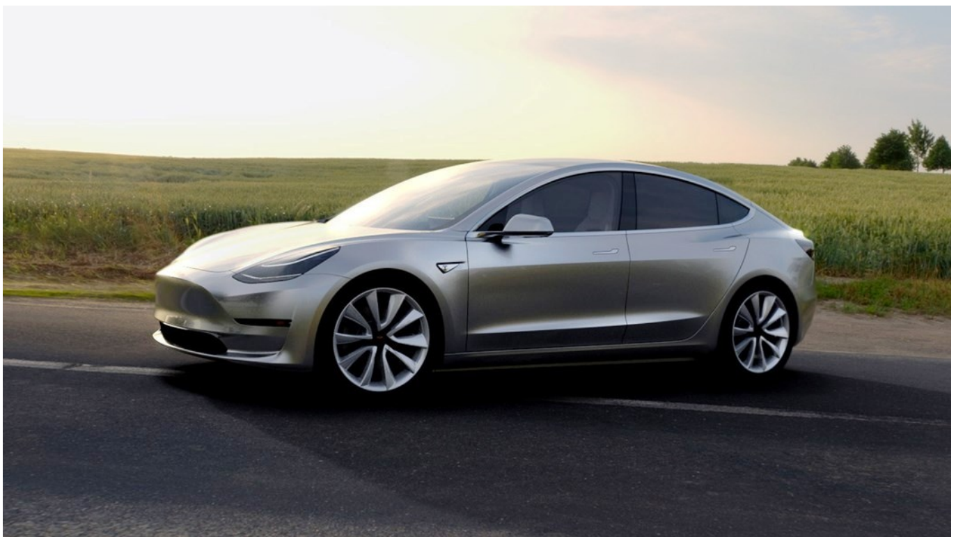
Tesla Model 3 leads UK electric vehicle sales in December 2020.

Demand for battery electric vehicles (BEVs) grew by 185.9% to 108,205 units, while registrations of plug-in hybrids (PHEVs) rose 91.2% to 66,877.