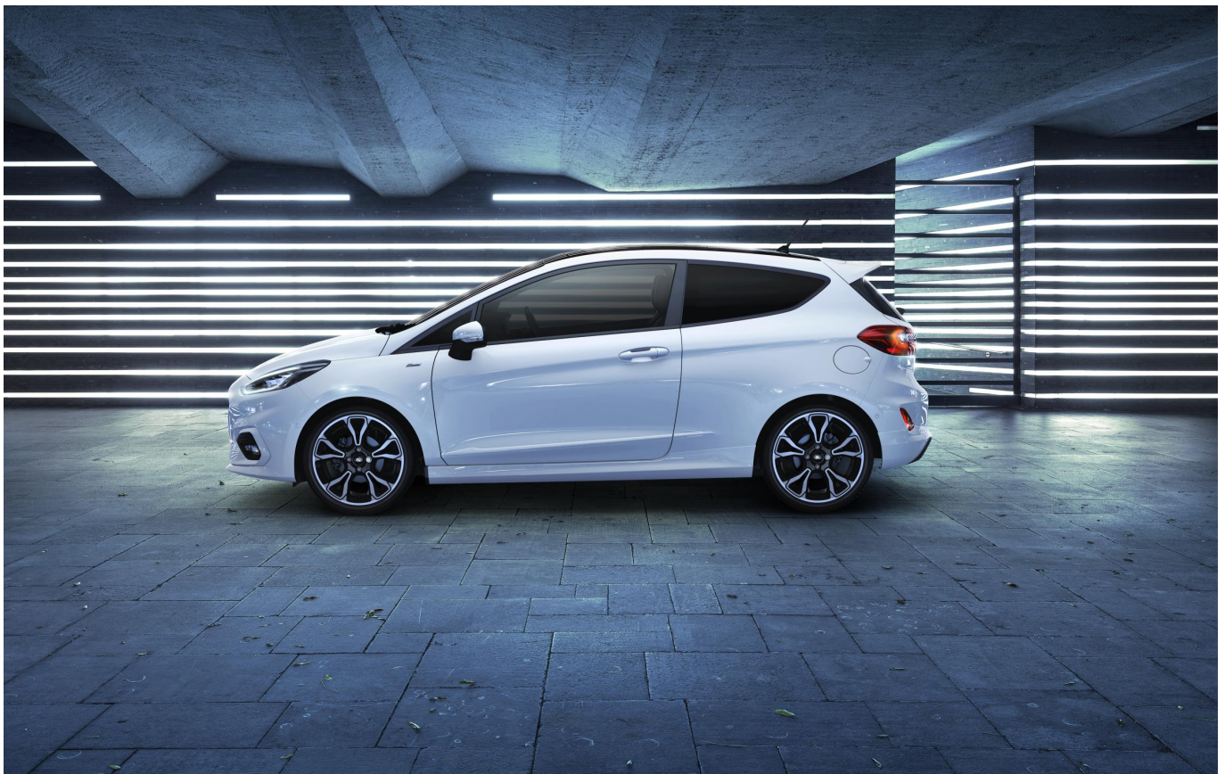
2020 Ford Fiesta.

Online version: https://www.wheels-alive.co.uk/uk-new-car-sales-review/