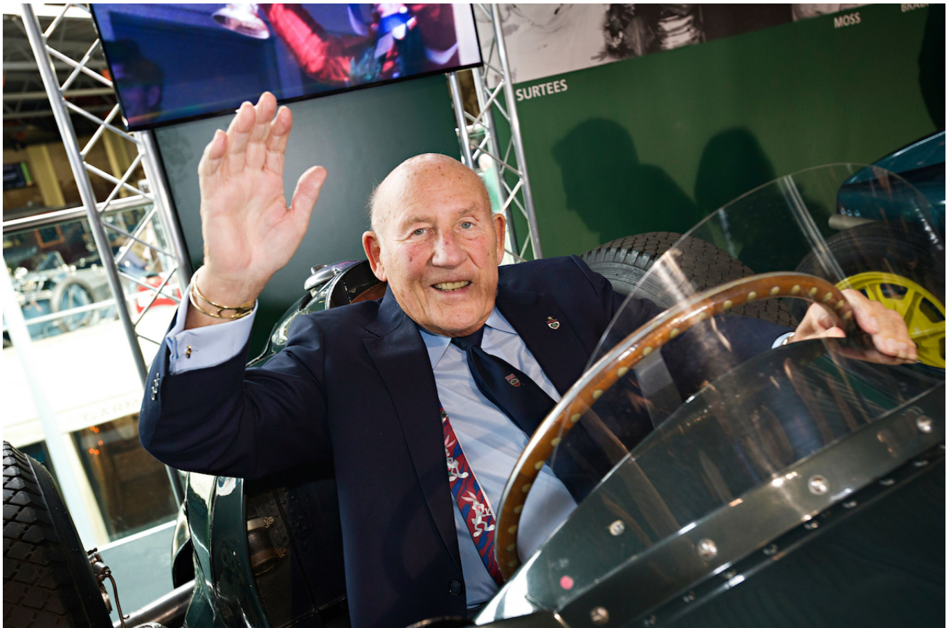
05 March 2015. Opening of two motor sport displays; Grand Prix Greats and Road, Race and Rally, collectively known as A Chequered History. VIP guests Murray Walker and Sir Stirling Moss officially open the new exhibitions.

https://www.wheels-alive.co.uk/the-passing-of-the-motor-racing-legend-that-was-sir-stirling-moss-obe-and-a-statement-from-lord-montagu/