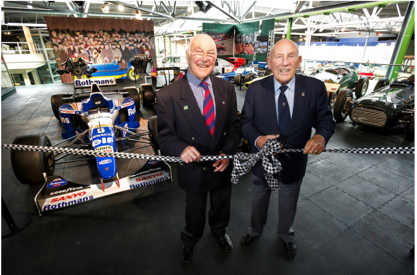
05 March 2015. Opening of two motor sport displays; Grand Prix Greats and Road, Race and Rally, collectively known as A Chequered History. VIP guests Murray Walker and Sir Stirling Moss officially open the new exhibitions.

Sir Stirling Moss, OBE, had a long connection with the National Motor Museum. He came to Beaulieu on April 5 th , 1959 for the opening ceremony of the new Montagu Motor Museum buildings, which were officially opened by Lord Brabazon of Tara. Other motoring personalities there included Raymond Mays, Tony Brooks, the Marquess of Camden and George Eyston.