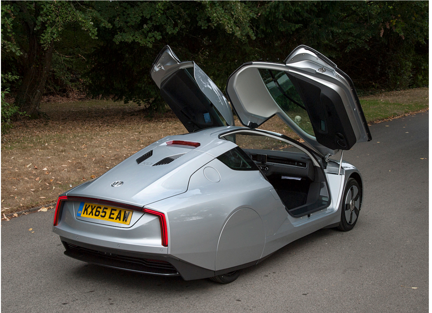
2014 Volkswagen XL1 hybrid.

Visitors to the Museum will see bold visions for vehicles and the built environment in which they would operate. The title of the exhibition is inspired by the work of British architect Geoffrey Alan Jellicoe. In the 1950s he described the place where vehicles and humans co-exist in harmony as Motopia. Much earlier, at the turn of the 20th Century, another visionary, John Scott Montagu, second Lord Montagu of Beaulieu, was predicting fast roads connecting cities. Successive generations have taken these ideas and built upon them. The exhibition looks at those and other visions of the future from the past.