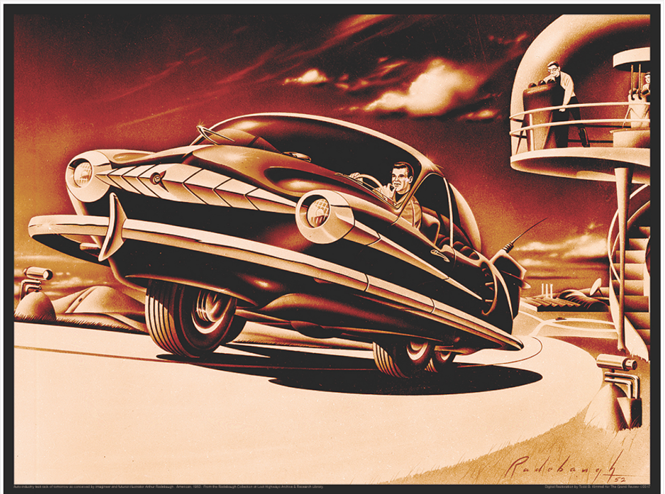
Arthur Radebaugh - AtomicCar.

https://www.wheels-alive.co.uk/the-motoring-future-is-brought-back-from-the-past-at-the-national-motor-museum/