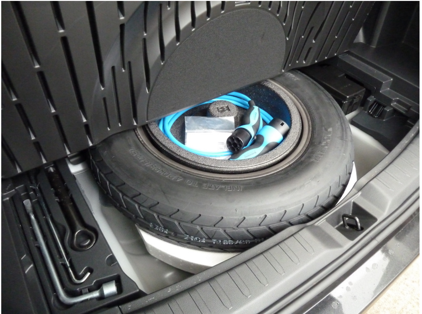
Spare wheel plus optional charging point cable.