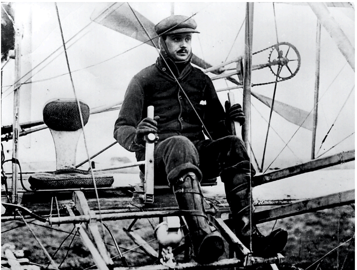
Charles Stewart Rolls, 27.8.1877 - 12.7.1910, British motoring and aviation pioneer, at the aircraft controls...

Online version: https://www.wheels-alive.co.uk/rolls-royce-pays-tribute-to-founders-pioneering-flight-of-2nd-june-1910/