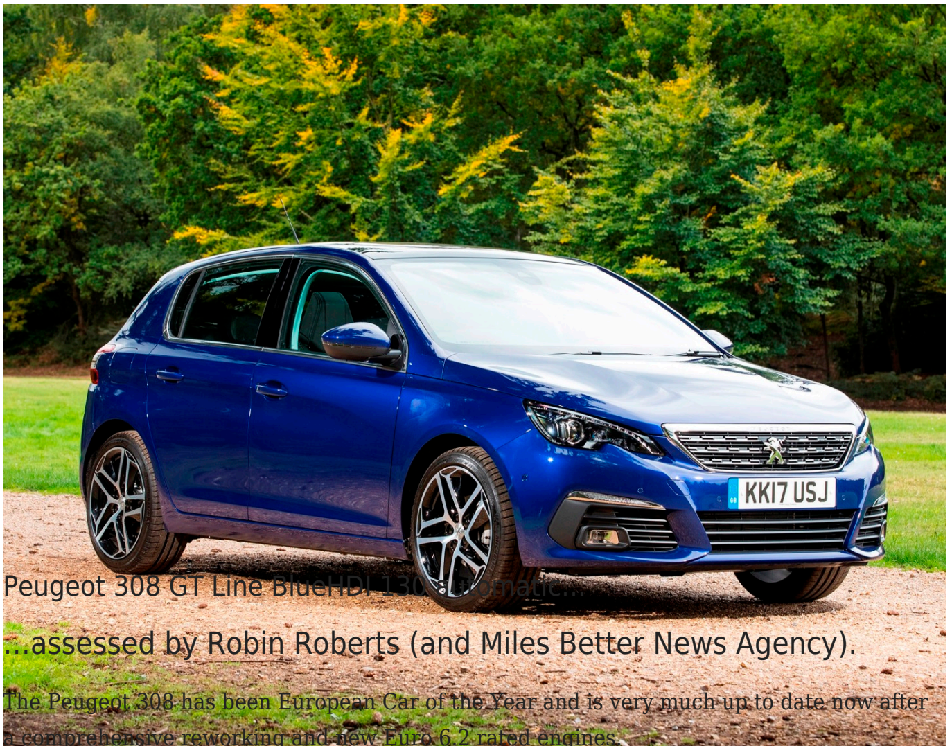
Peugeot 308 GT Line BlueHDI 130 Automatic