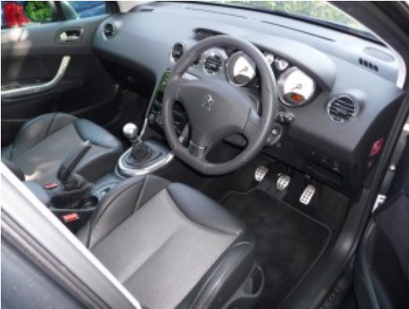
The driving compartment is comfortable and attractive.