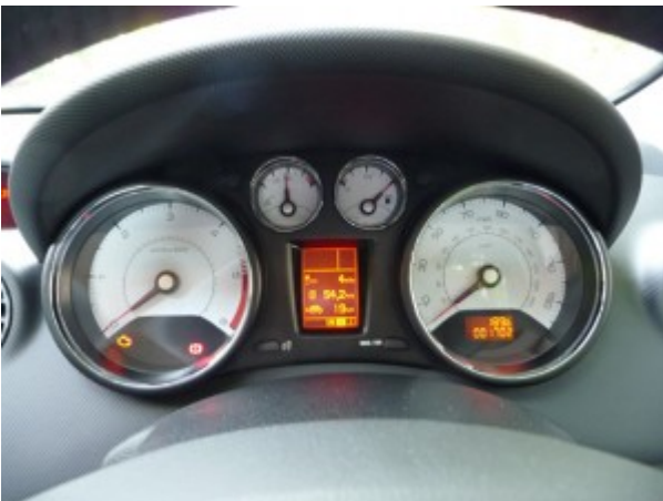
Instrumentation is smart and easy to assimilate.