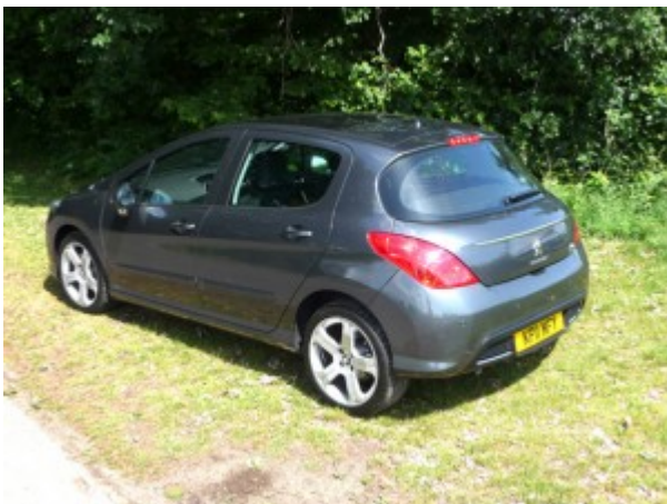
The rounded rear end conceals a large luggage compartment. Note the wide doors - aiding entry and exit.