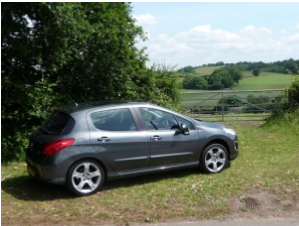
Side view shows styling lines flowing from nose to tail.

To find out if the Peugeot 308 e-HDi fulfils all its aims, I lived with an example for a week, during which time it was subjected to local commuting and shopping runs, gentle cruising and a 500 mile round trip with the vehicle fully laden with passengers and luggage.