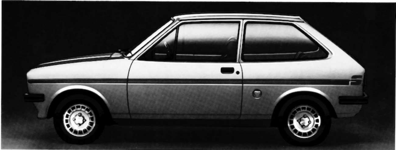
Fiesta 5 with optional alloy wheels, head restraints and radio at extra cost.