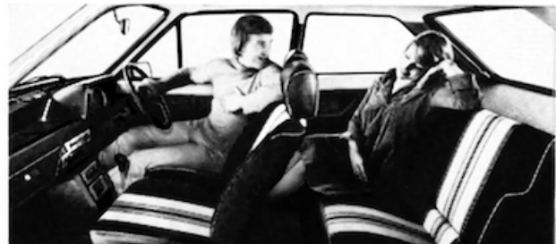
The Fiesta has more legroom in the back than any comparable car.

There is more legroom in the back of the Fiesta than in any comparable car, and that's where it matters most. It's only a matter of inches more, but it feels even bigger than it really is. And it's really light and airy inside. The glass area is no less than 25 sq. ft., and you have 309° of all round vision. Quite a safety feature.