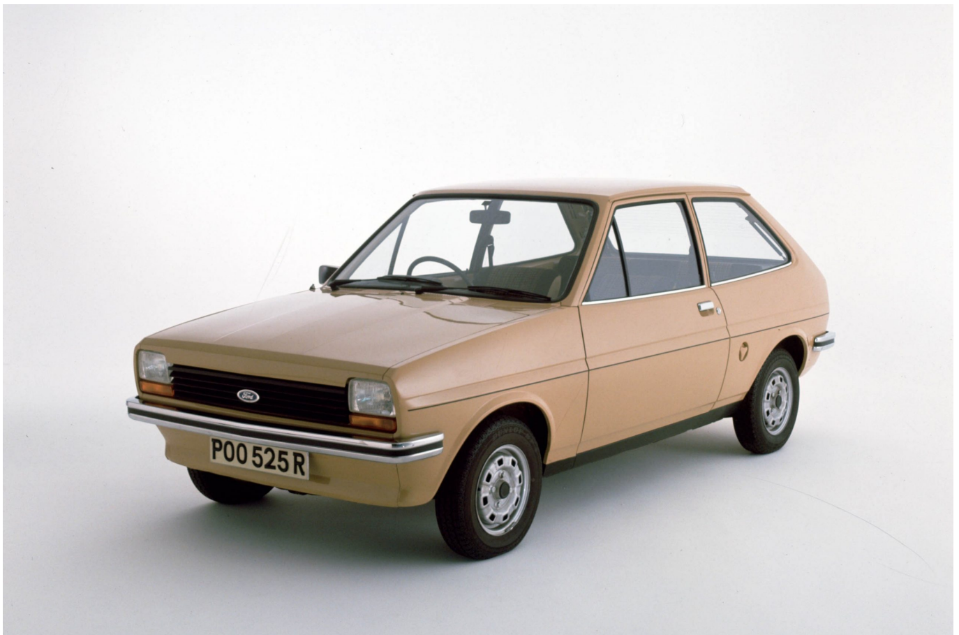
A first generation Fiesta, from 1976.

Online version: https://www.wheels-alive.co.uk/news-fords-fiesta-comes-to-the-end-of-its-production-road/