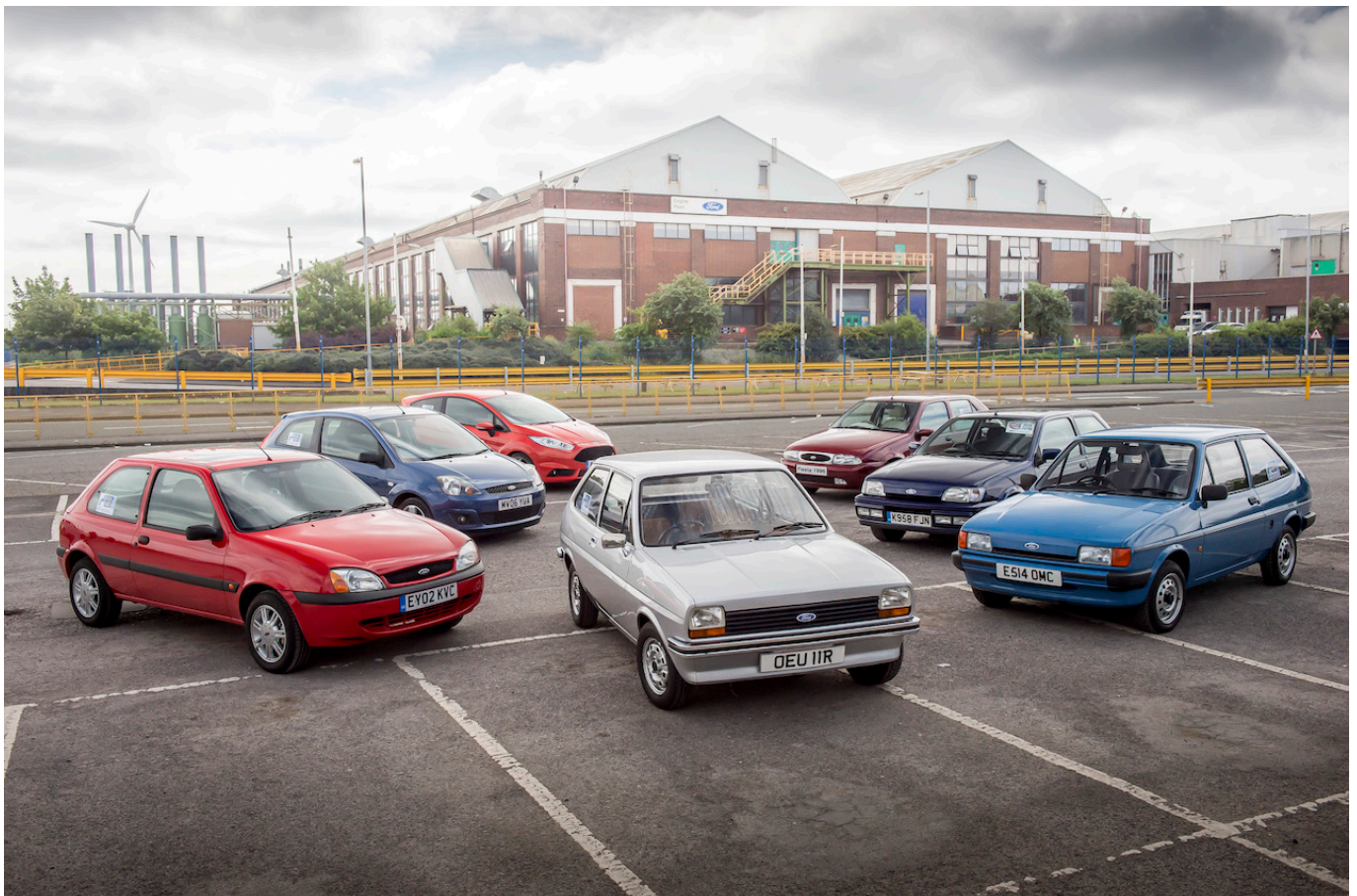
A selection of Fiestas through the years. (Image from Ford archives).

The highly popular baby Ford created in the wake of the early 1970s oil crisis to get Britons moving again will roll off the Cologne, Germany production line for the last time next June, after 45 years of sales.