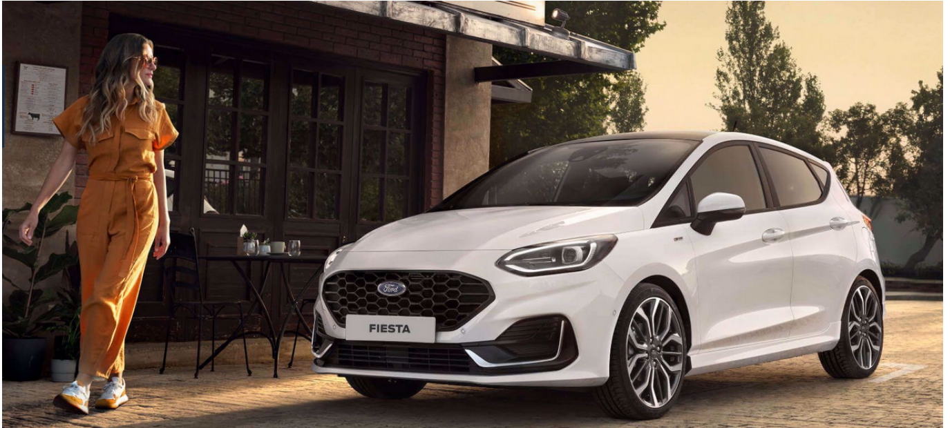
Ford Fiesta 2022 brochure shot.