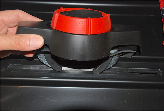
Clamp pushes through slot in rail on box...