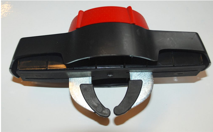
Clamp fully tightened...