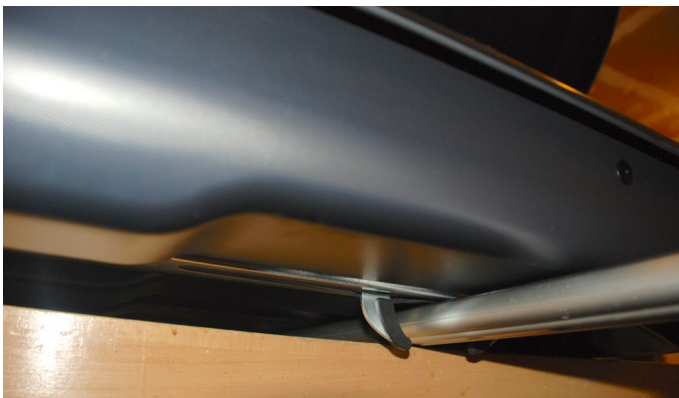
Clamp locks on to roof bar...