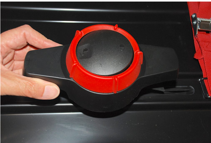
Premier Fit clamp has large adjuster wheel, with 'press down' lock in centre...