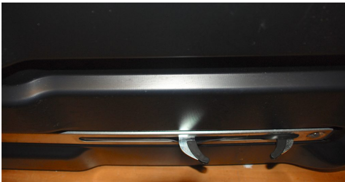
Clamp passes through base of box...