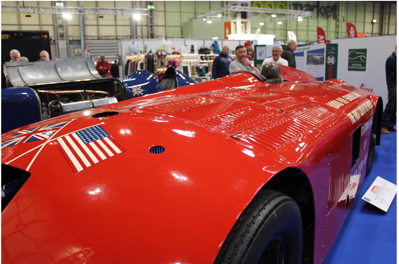
The Sunbeam at the NEC in Birmingham.