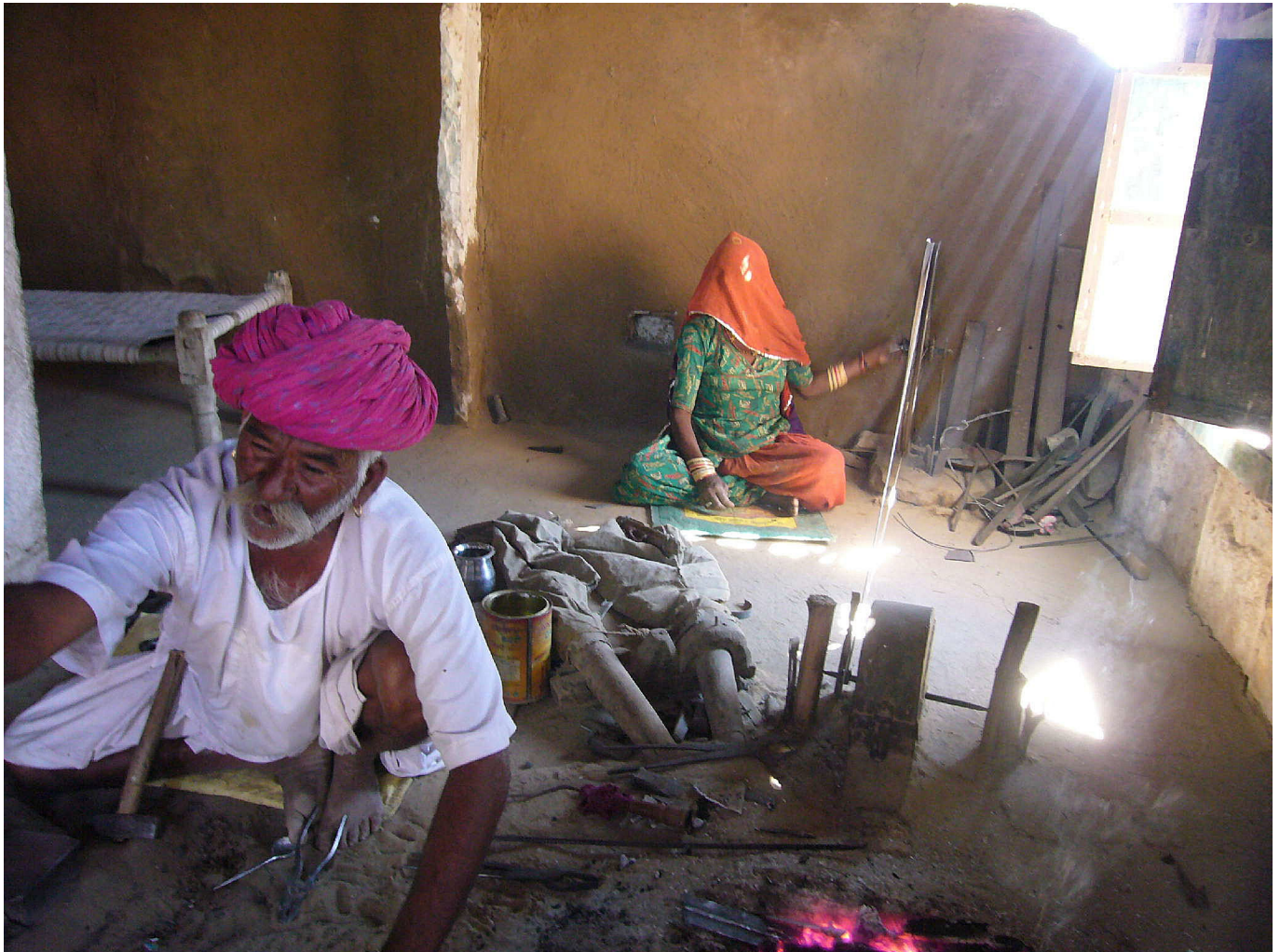
Above: A Rajasthan blacksmith and his wife, with the traditional veil covering her face. She operates the homemade bellows to power the forge where her husband makes trinkets to provide income from tourists to the Thar Desert.