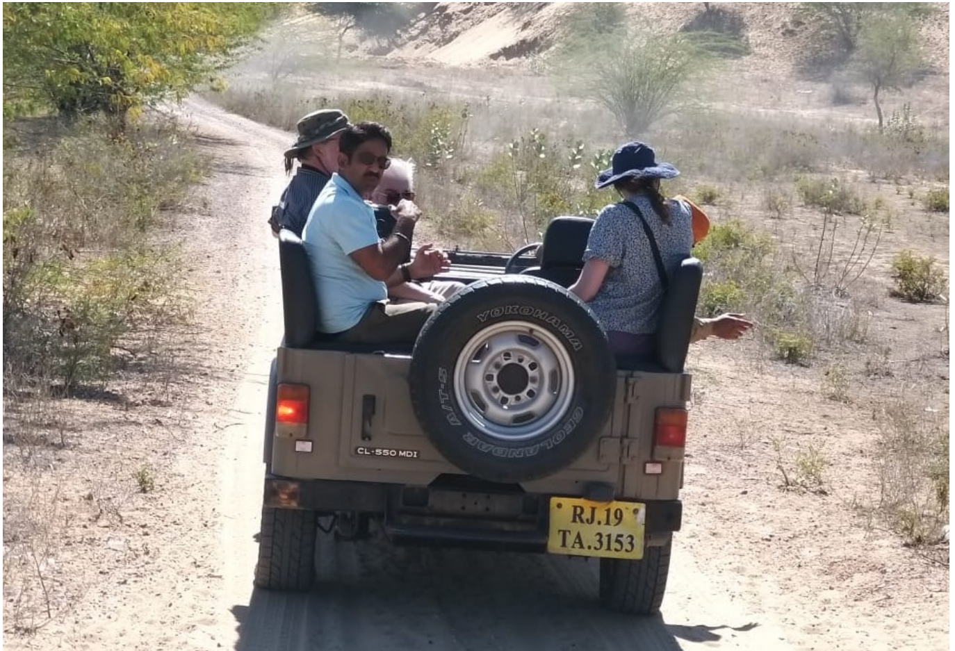
Above: Off-roading experiences for tourists are a popular new attraction in the Thar Desert.