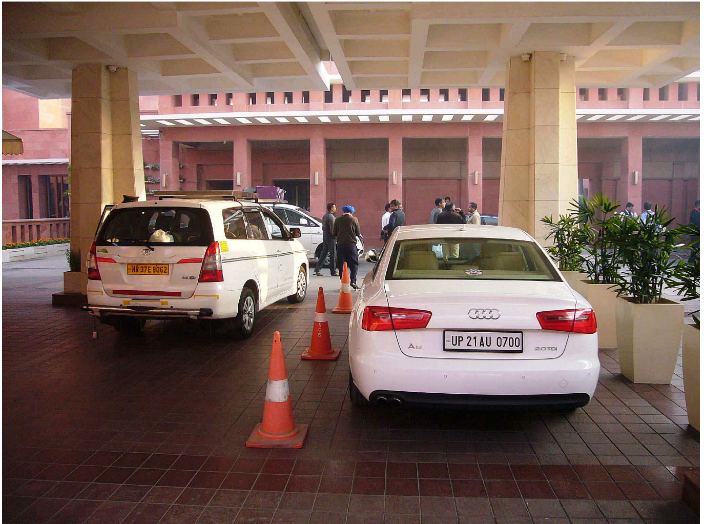
Above: Much in evidence are premium brand executive cars such as Audis which are commonplace outside hotels alongside India's now favourite choice of taxi - the Toyota Innova 7-seat MPV.