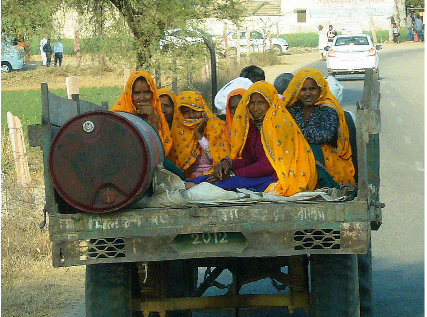
Above: A Rajasthan family making their way back to their Thar Desert home complete with a barrel of fuel.