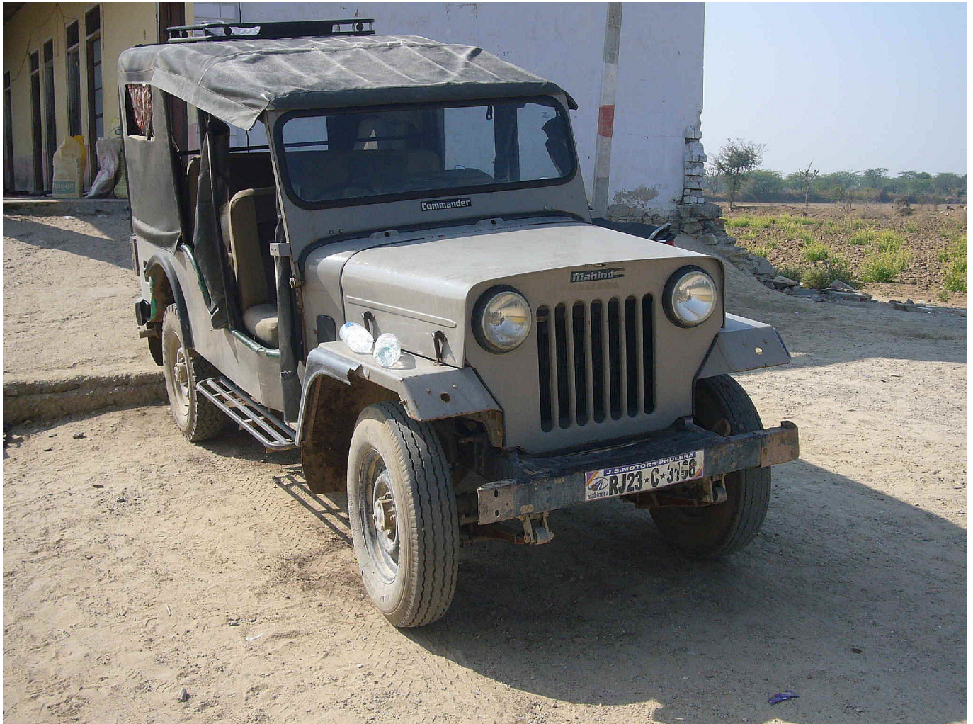
Above: A long serving Mahindra jeep is still the rugged vehicle of choice for rural people in the Thar Desert. This one was owned by the schoolmaster. New schools are springing up as the wealth of the former nomadic Thar Desert region improves.