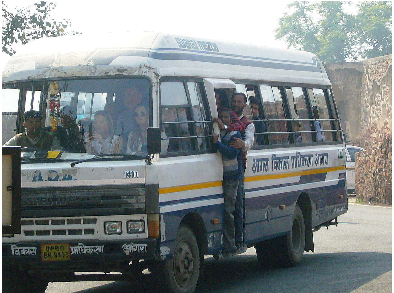
Above: All aboard, a local bus used by rural classes as well as back-packing tourists.