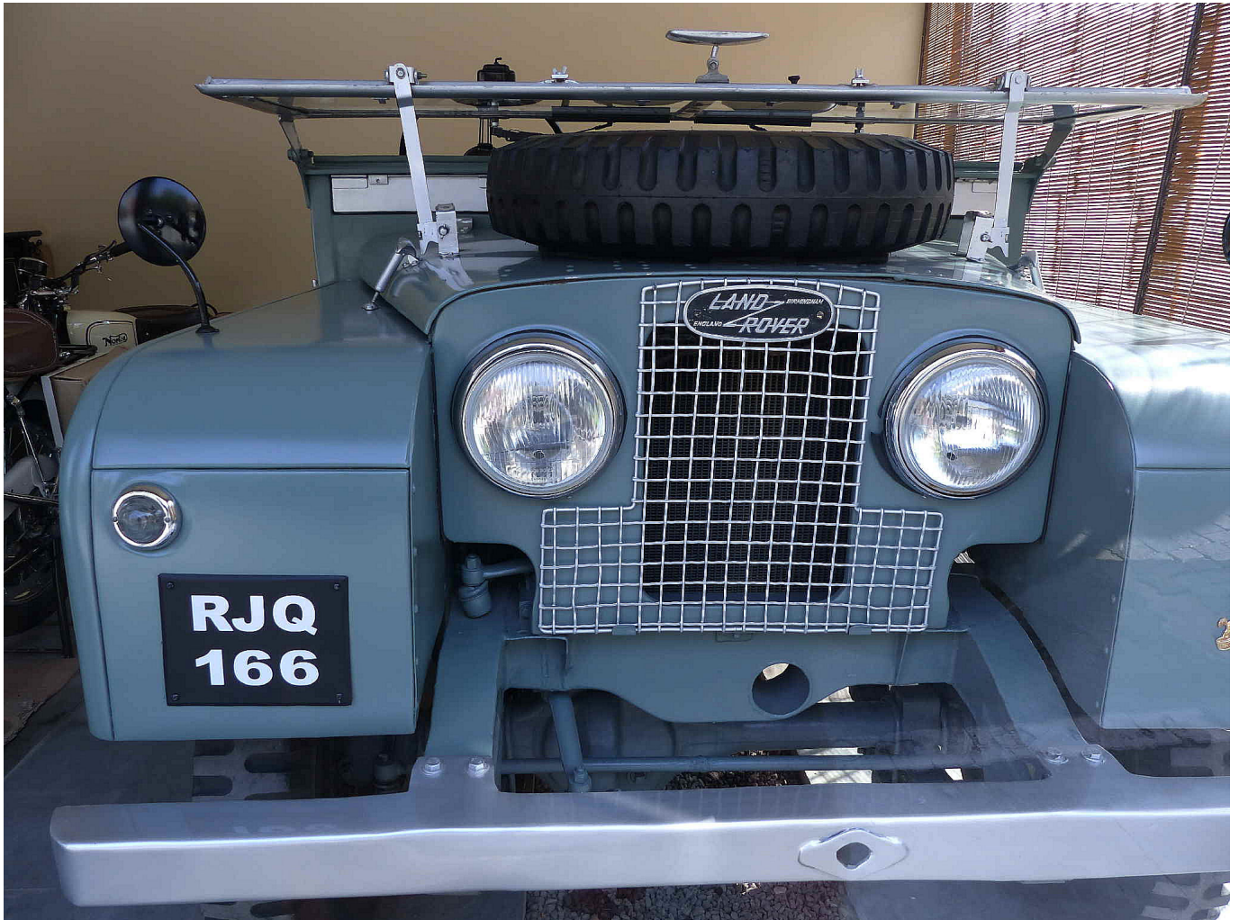
Above: A Series 1 Land Rover part of a collection of historic British vehicles at a Rajasthan heritage hotel.