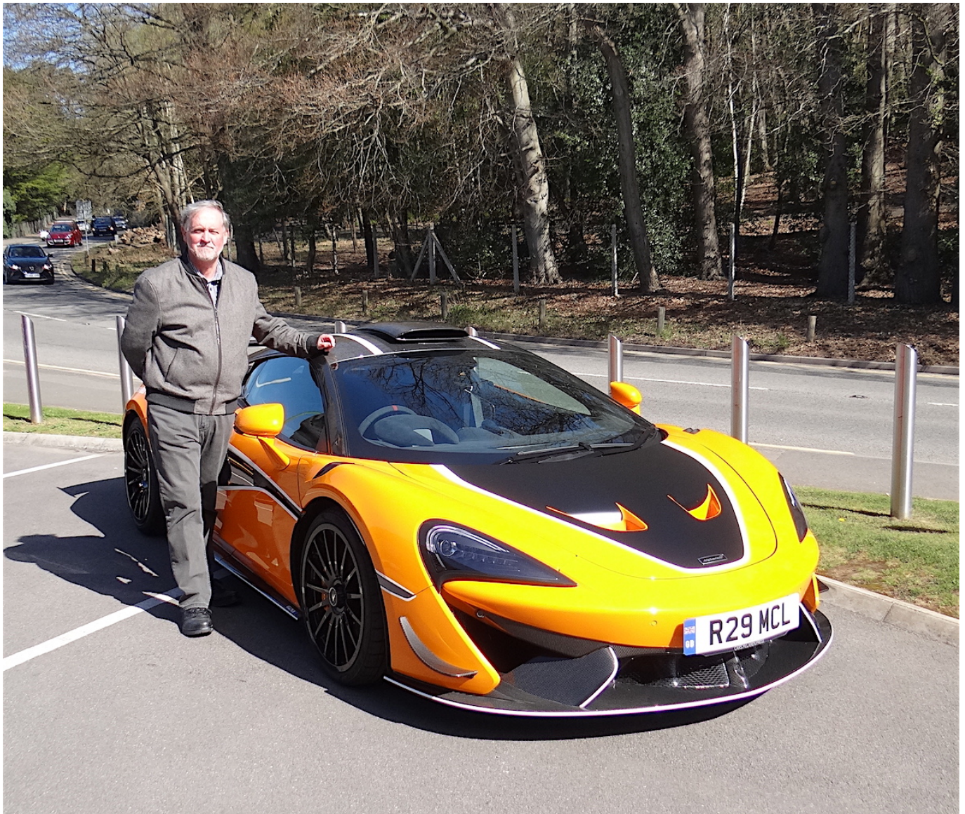
The author with the new 620R.

Online version: https://www.wheels-alive.co.uk/mclaren-620r-first-drive/