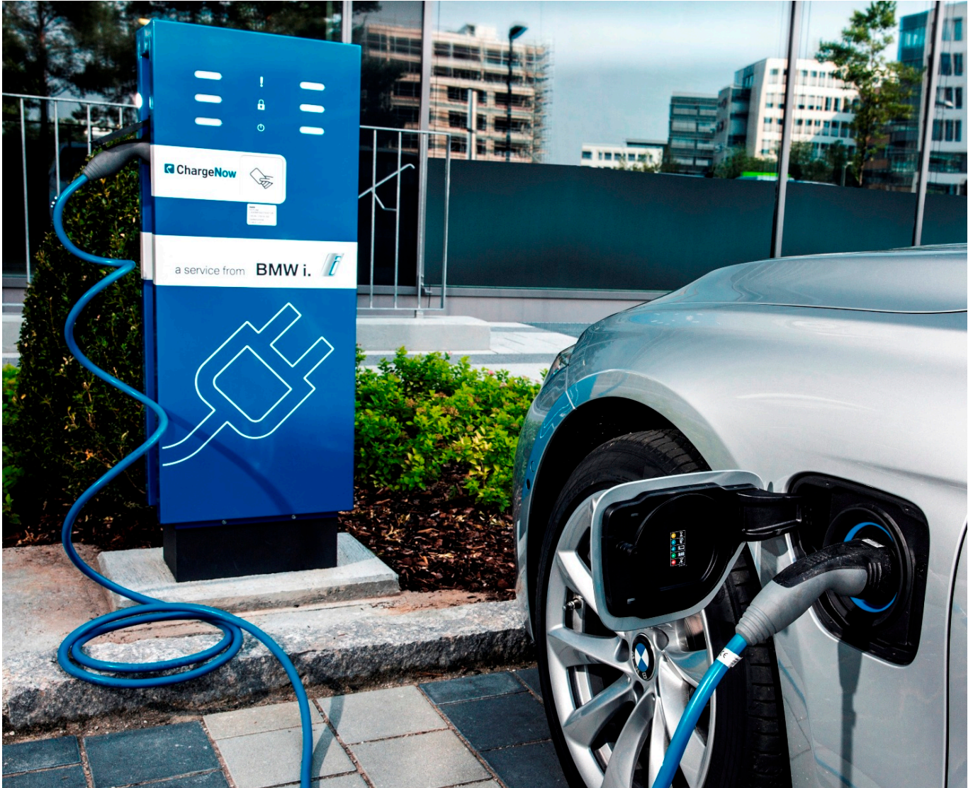
330e being recharged...

This week BMW UK held a media test driving event with most of their PHEV models available for test driving. This coincided with this week's United Nations Climate Change Conference being held in Madrid and runs to 13 December. At this conference BMW, to further reduce carbon emissions, announced their plans to use zero emission cargo vessels from 2030 as maritime transport currently accounts for 50% of the BMW Group's transport chain.