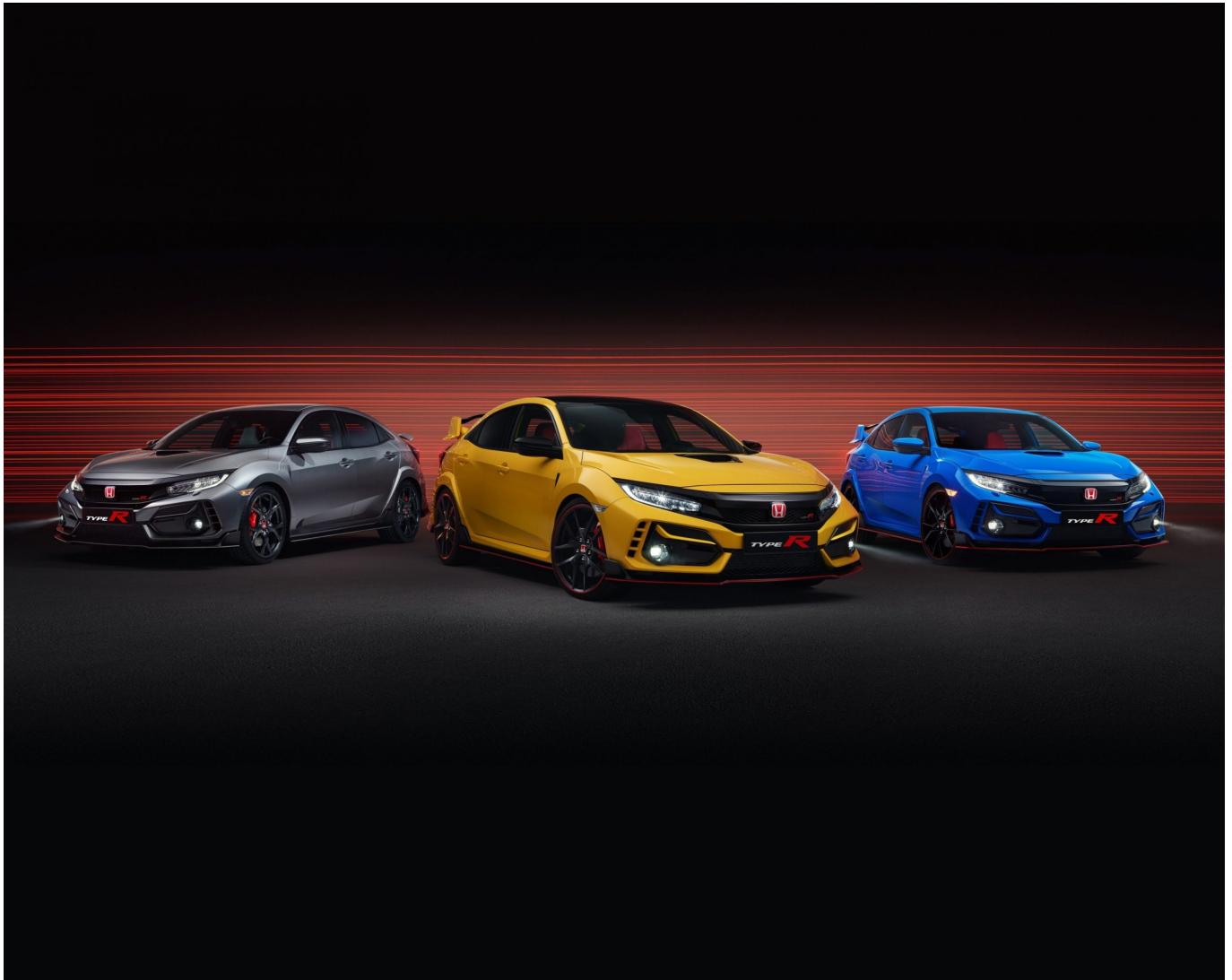
2020 Civic Type R family.

Inside all models feature revised tactility and improved touch points with a new Alcantara wrapped steering wheel, a counterweighted teardrop gear knob and physical controls for the infotainment and climate systems. For the more enthusiastic owner there is a new intelligent Honda LogR app that allows the user to capture, log and review vehicle and driver performance data to improve track performance, and of course the Civic Type R has been a prominent contender in various Touring Car Series.