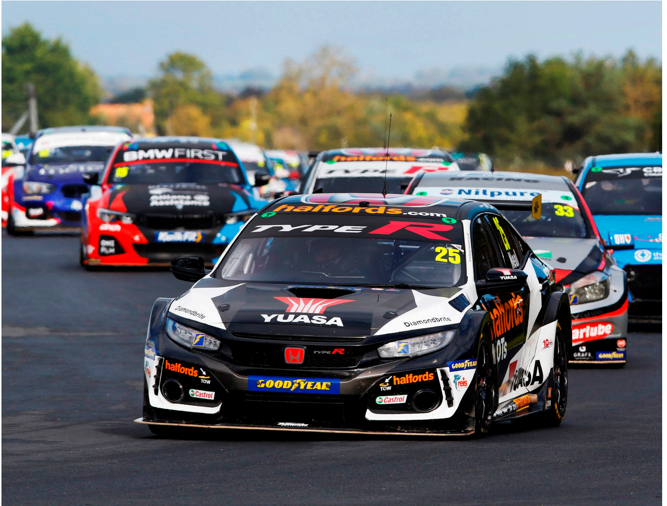
Honda Civic Type R Touring Car successes.