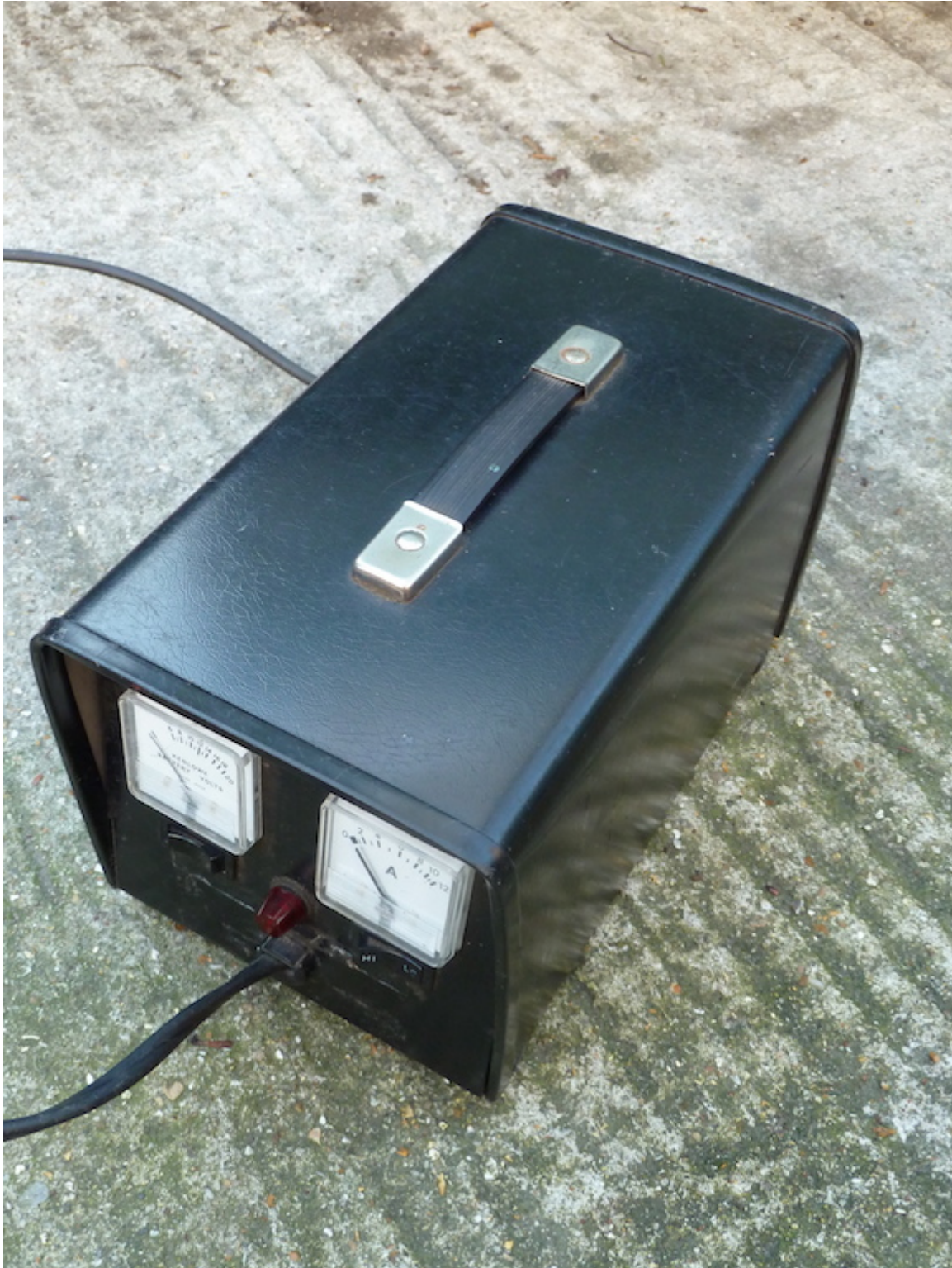
A good quality trickle charger is invaluable.