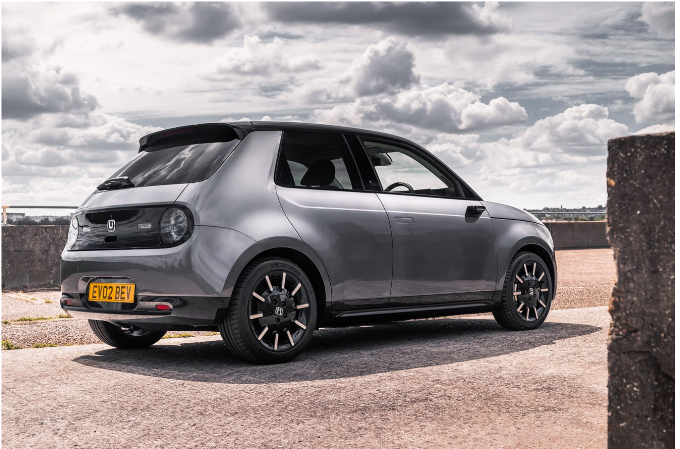
2020 Honda e

Against: Modest range even for a commuting car, not roomy, significant road noise intrusion, firm-ish ride, average warranty.