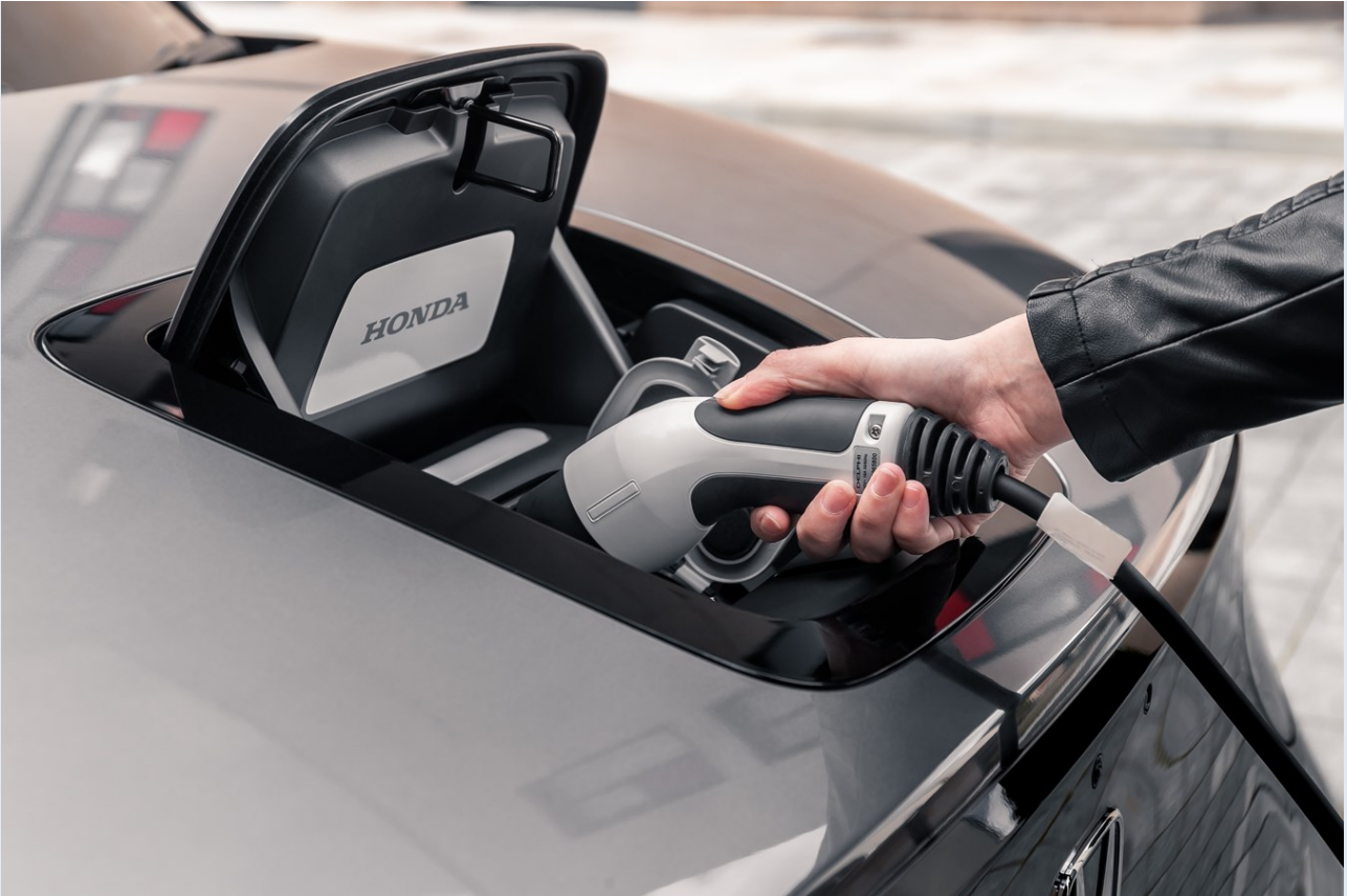
2020 Honda e