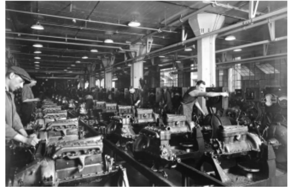
ABOVE 1917 engine assembly.