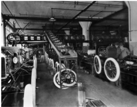
RIGHT 1914 Highland Park radiators on chasis.