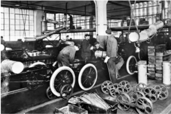
ABOVE 1914 Highland Park fuel tank installation.