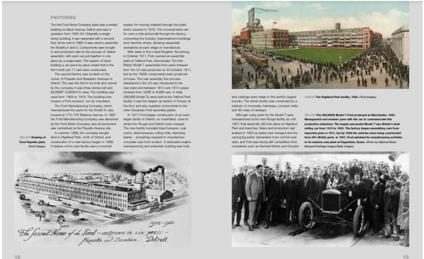
Model T factory views... A double page spread from the book and showing the huge production facilities.

I like the way that the book is divided into separate, logically set out sections that are easy to read.