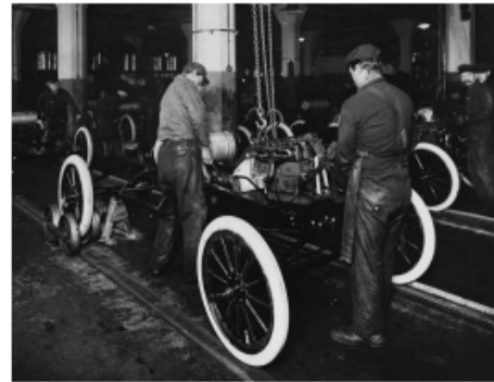
LEFT 1913 Highland Park engine installation. A 'push type' assembly line at the Highland Park plant in Michigan. The photograph shows a Model T engine being dropped into place by use of an overhead block and tackle. The picture was taken in early 1913 and it shows how the rear wheels were cradled in a three-wheel dolly which moved along a track on the floor. Cars were pushed from one station to another for assembling.

A page view showing contemporary shots of Model Ts on the production line.