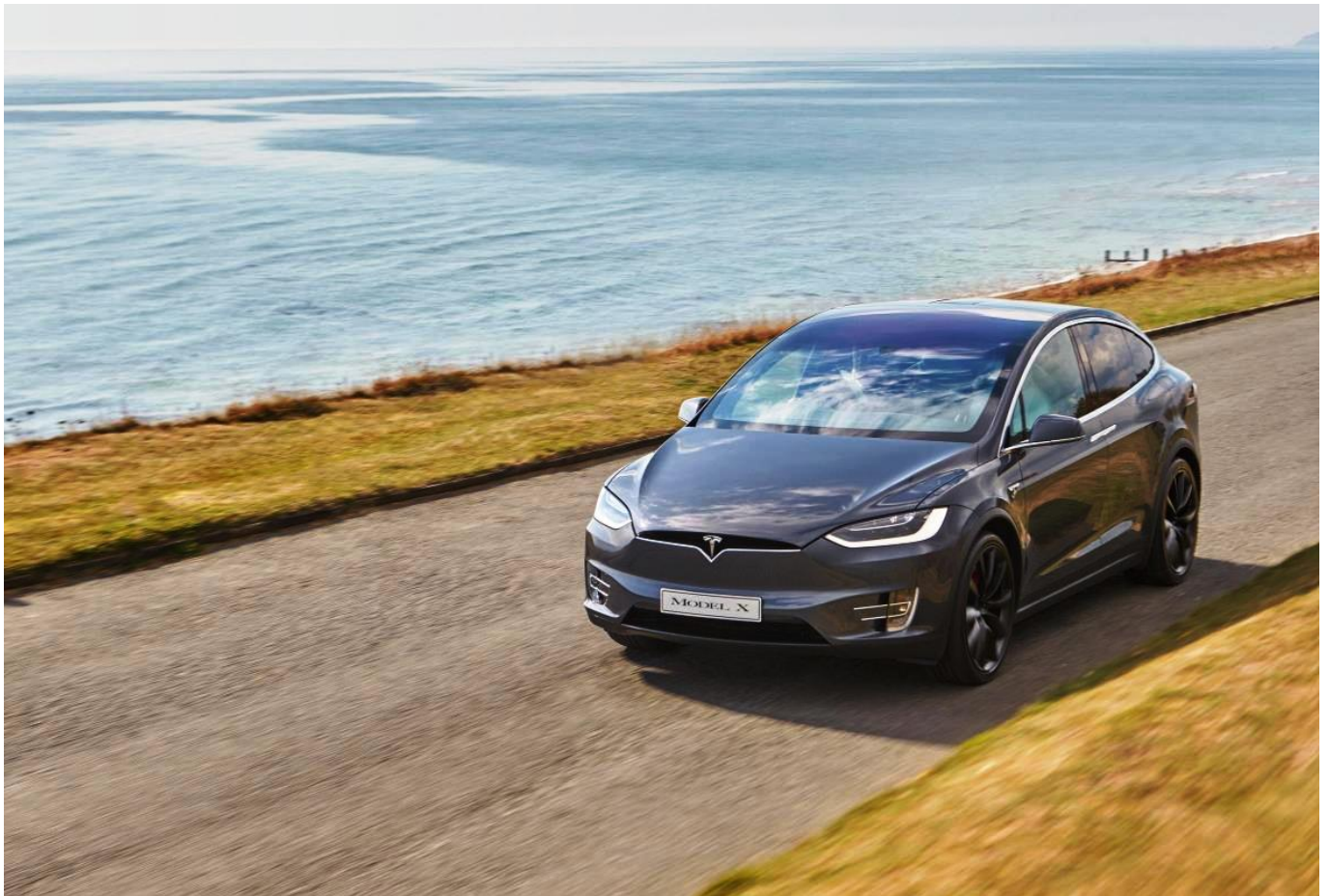
Tesla Model X

It's no surprise to see Audi, Jaguar and Tesla in the top spots, with the e-tron, I-PACE and Model X, respectively in the top 3 places.