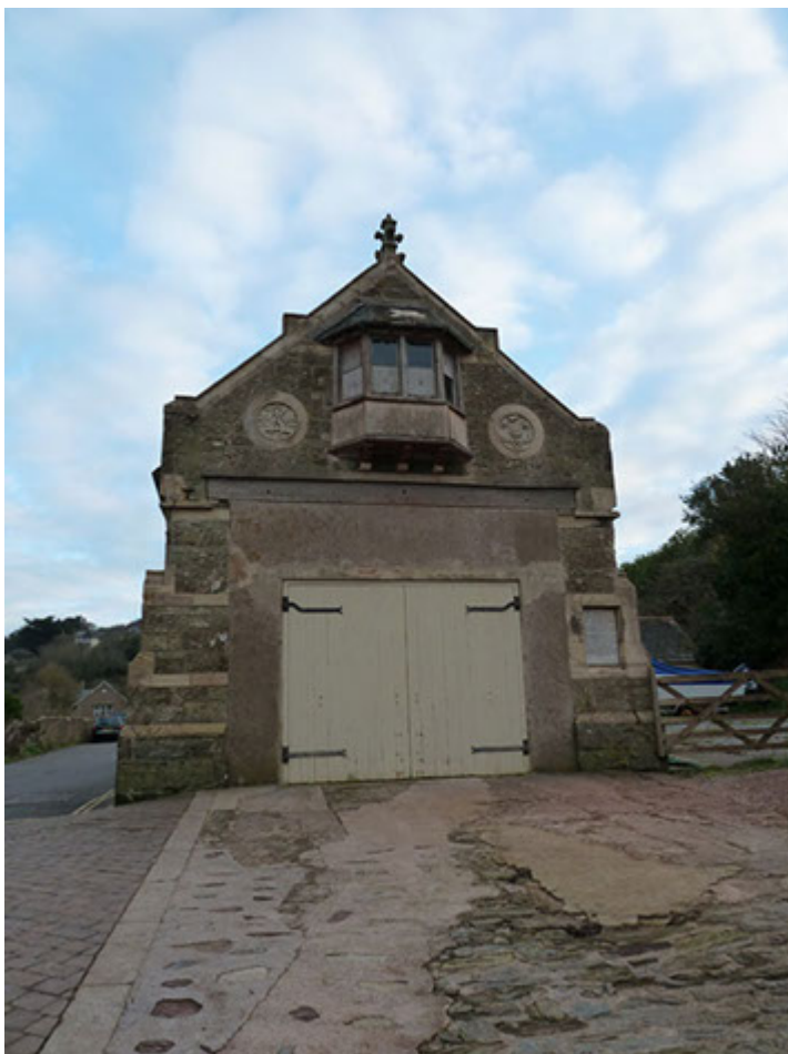
Just above the beach at Hope Cove is this old lifeboat station, ornately-decorated and with an outlook westwards across the sea, also with a

Another day trip we enjoyed from Shaldon was down again to Totnes, then into the quiet countryside (that's hardly changed for decades, if not centuries...) to the pretty village of Harberton, to visit friends. From there a group of us ventured north-westwards to Shipley Bridge, near South Brent and on the edge of Dartmoor.