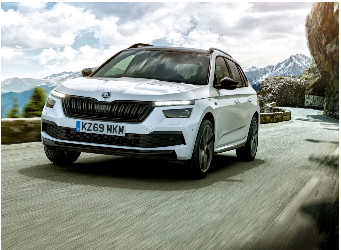
Skoda Kamiq - on-line real-time tour with a brand expert.

Currently, six hosts are providing live demonstrations from their driveways of the Kamiq, Superb, Octavia and Karoq and are using pre-recorded video footage to demonstrate the rest of the Skoda model range.