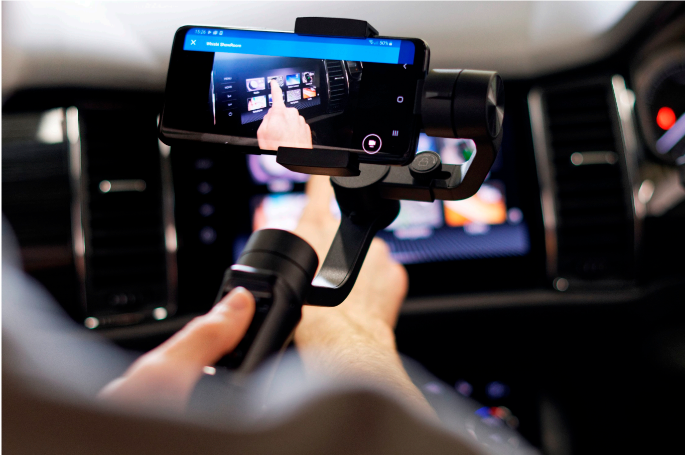
Skoda's latest innovation, the 'Live Tour'.

Virtual showrooms in the car sales industry is not a new thing, it's click and view, tick a few boxes, download a brochure and if you are lucky you might get a call-back from a sales person.