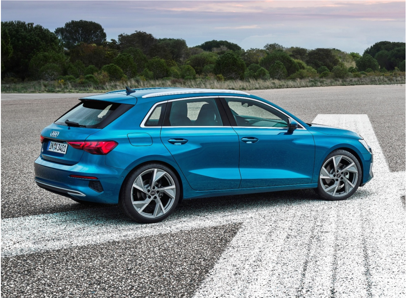
Audi A3 Sportback.

Now the Advertising Standards Authority say recipients of vehicles should make it clear when it's advertising or has a commercial message - a clear and prominent disclosure is needed. The ASA said it would now be examining again the social media posts of actors and suchlike.