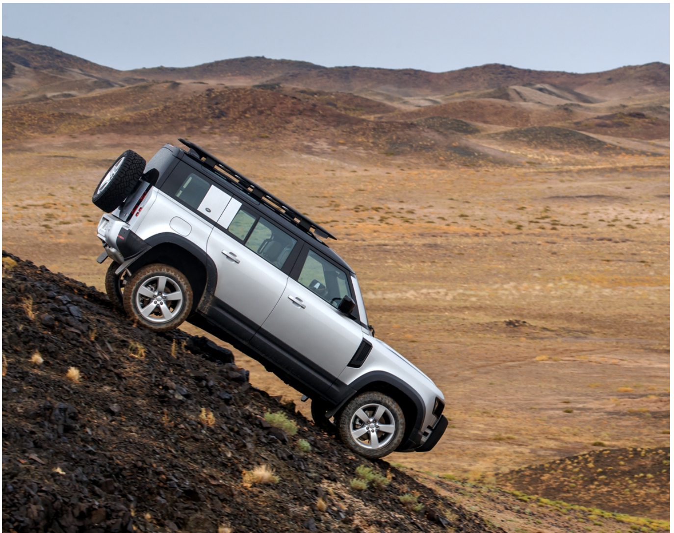
Land Rover Defender 110 in Namibia.

The new Land Rover Defender joins the fleet of British Red Cross support vehicles.