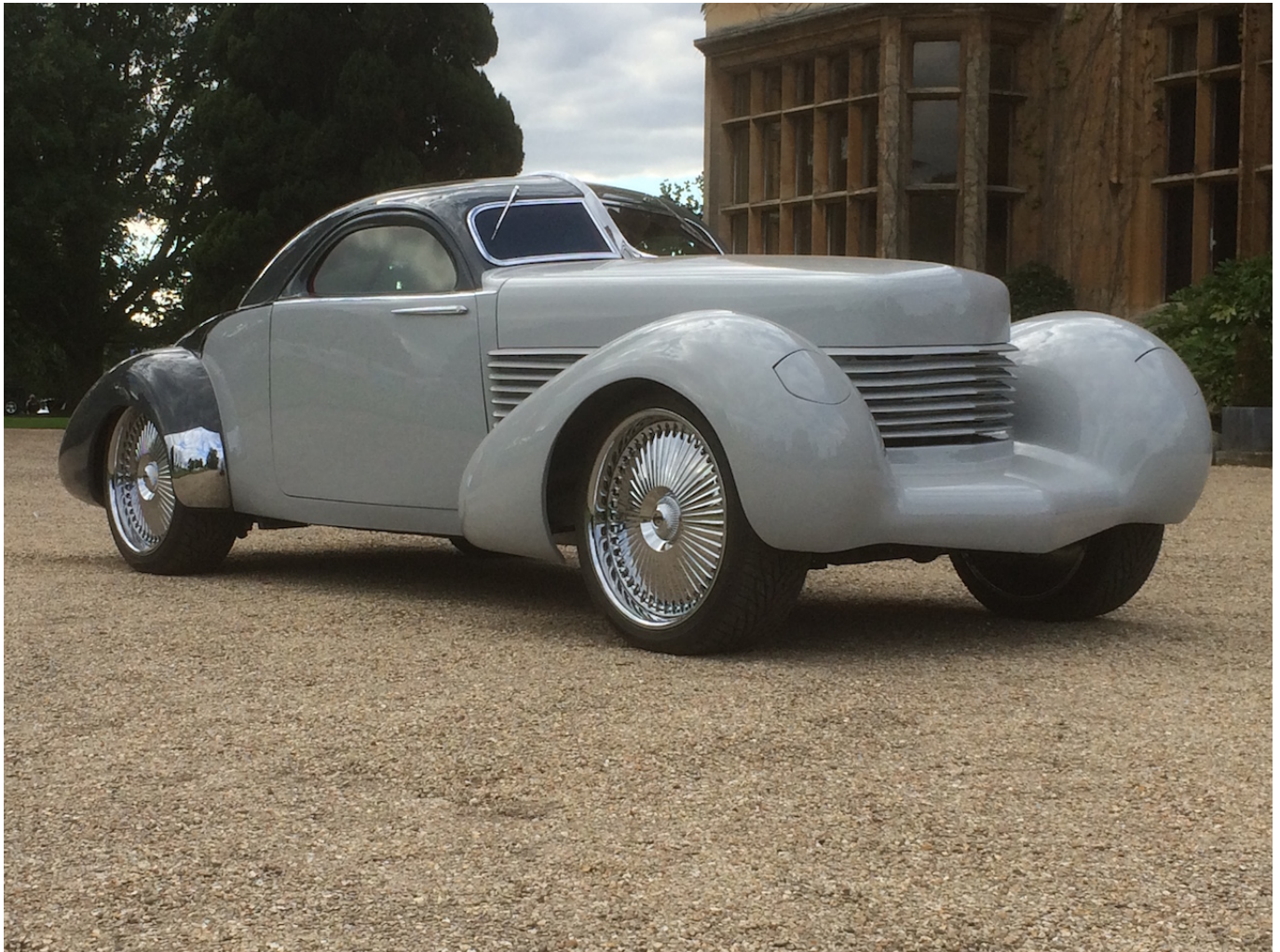
'Tetanus'... Photo copyright Andy Saunders, grateful thanks to him for its use here.

There will be plenty going on for the busy Father's Day show in the grounds of the National Motor Museum , with customised cars and hot rods, American motors, awesome motorbikes and trikes and pre-1980 classics filling the showground, while live entertainment and dancing will make it an unforgettable summer day out. Held in association with the Solent Renegades club, the Hot Rod & Custom Show is too good to be missed.