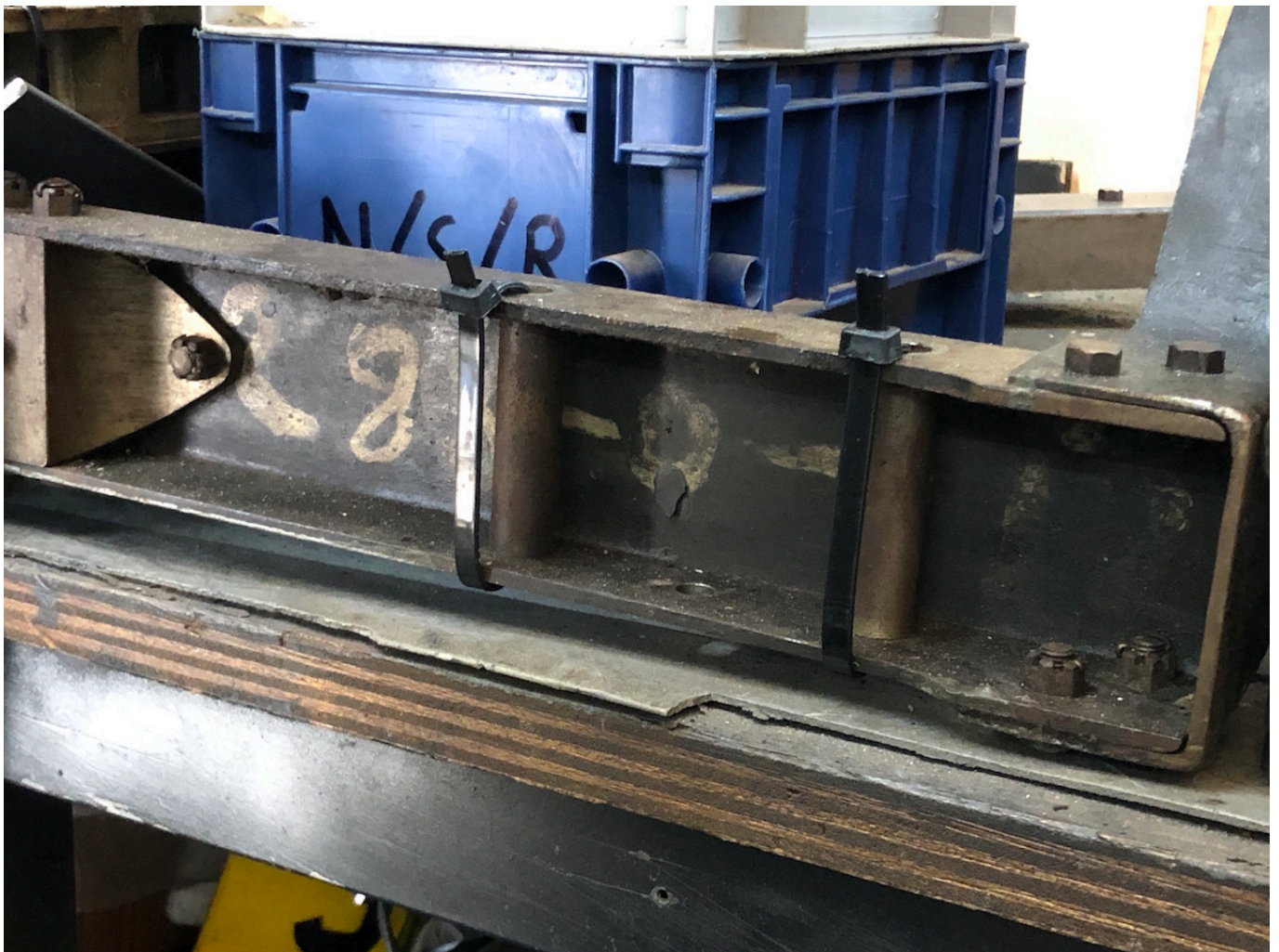
Original workmens' markings revealed on the Sunbeam 1000hp.

Specialist laser cleaning is also being used and four brake drums have been taken away by Laser Tec experts for cleaning. The stunning results of the technique were shown by removing Castrol R oil from an adjustable spanner, which had remained 'glued' to the chassis since Sunbeam's record-breaking run.