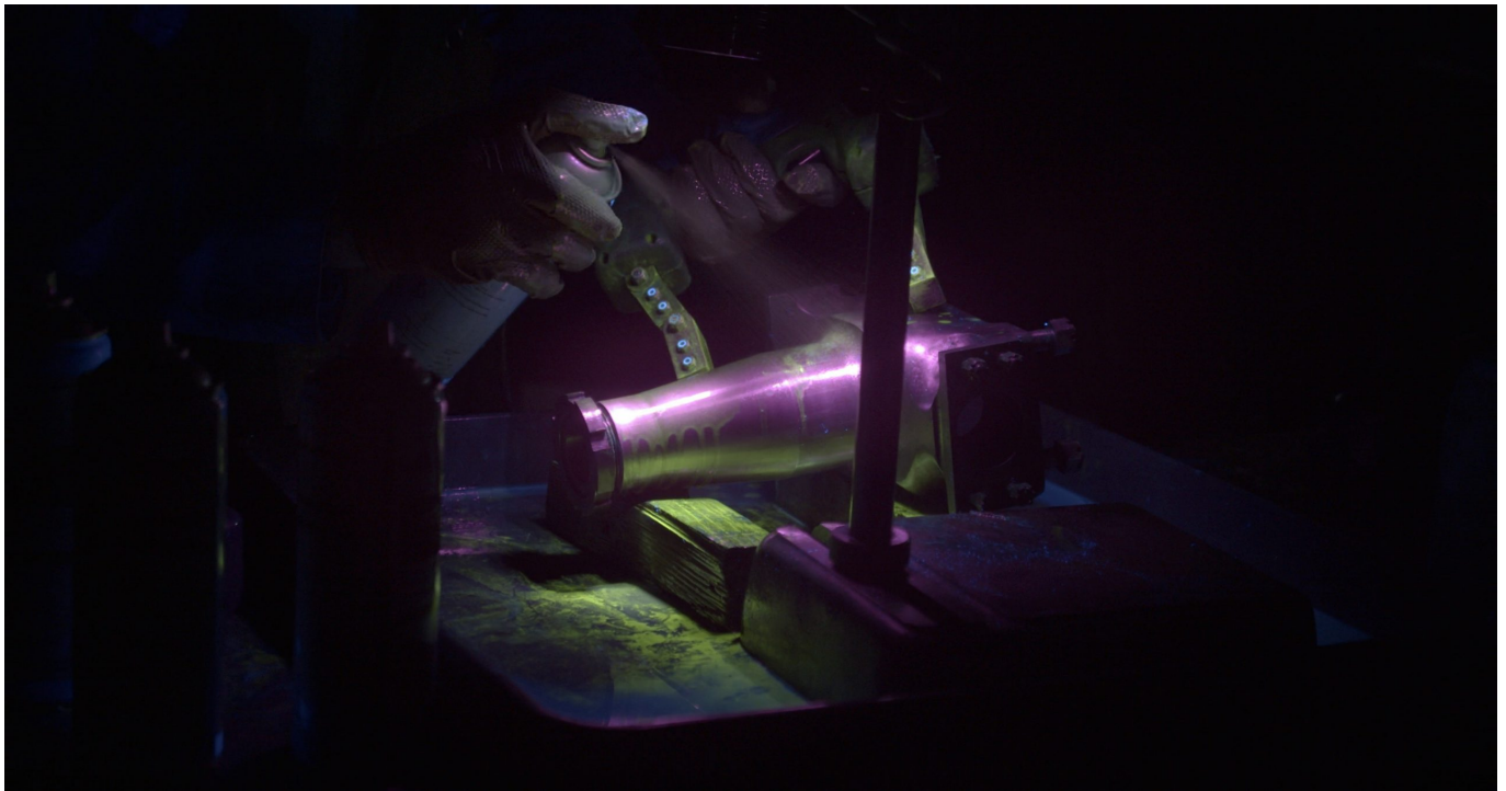
Crack testing with Ultra-Violet fluorescent light.

A visual inspection checked for potential problems, before a non-destructive solution with magnetic particles was sprayed over test areas to show any cracks under Ultra-Violet fluorescent light. A powerful magnifier helped to reveal whether marks were cracks or scratches on the axles, suspension units and machined metal parts.