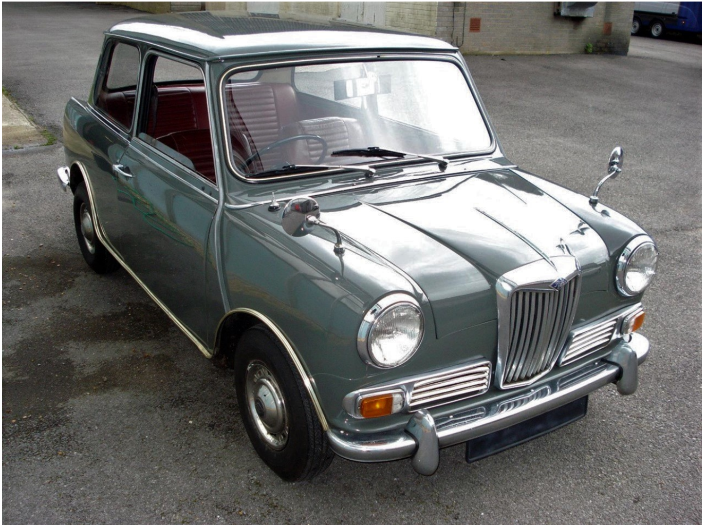
1967 Riley Elf.