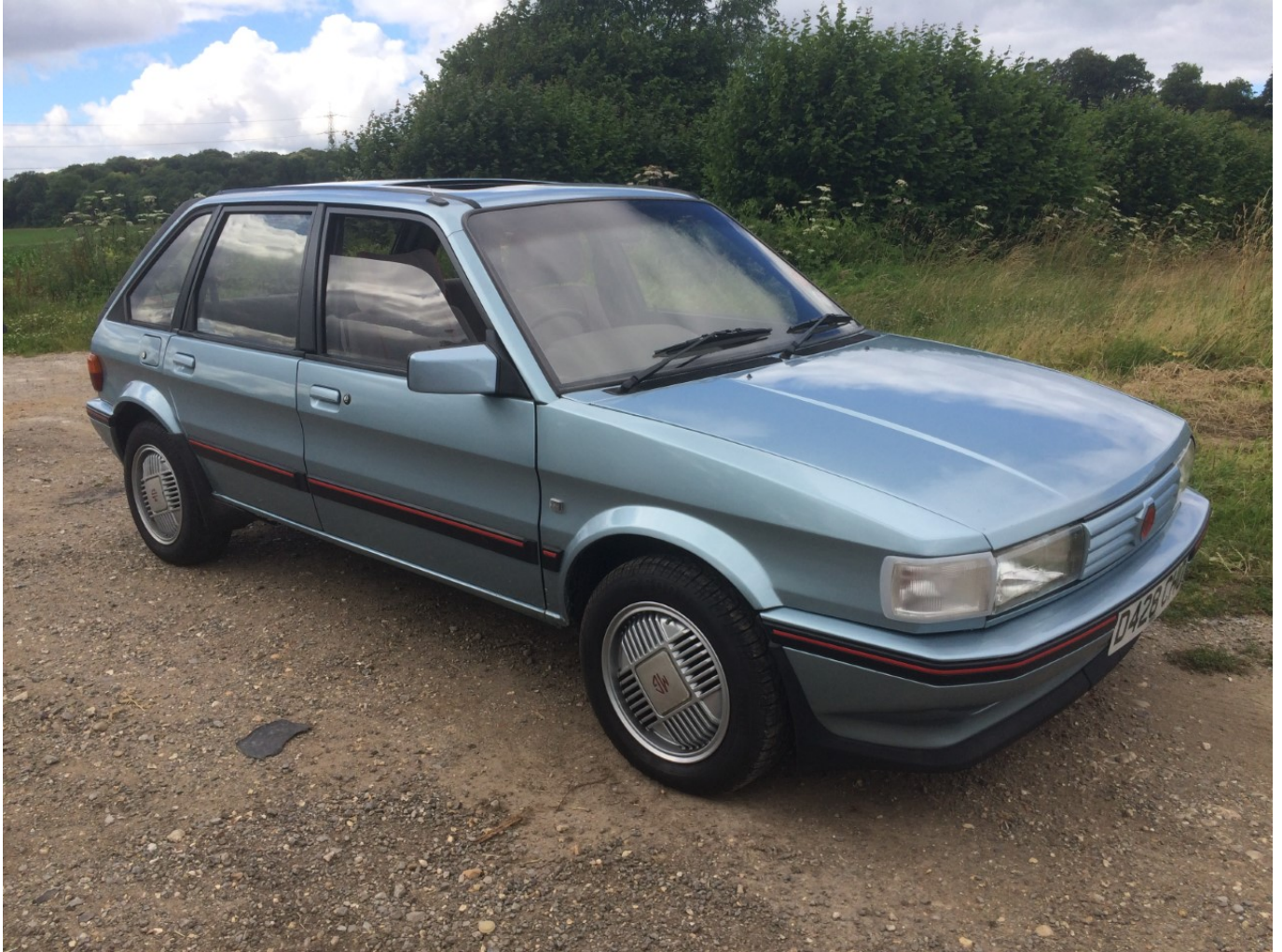
MG Maestro 2.0 EFi - available under the scheme.

period to avoid any disappointment but I still have cars available for April.”