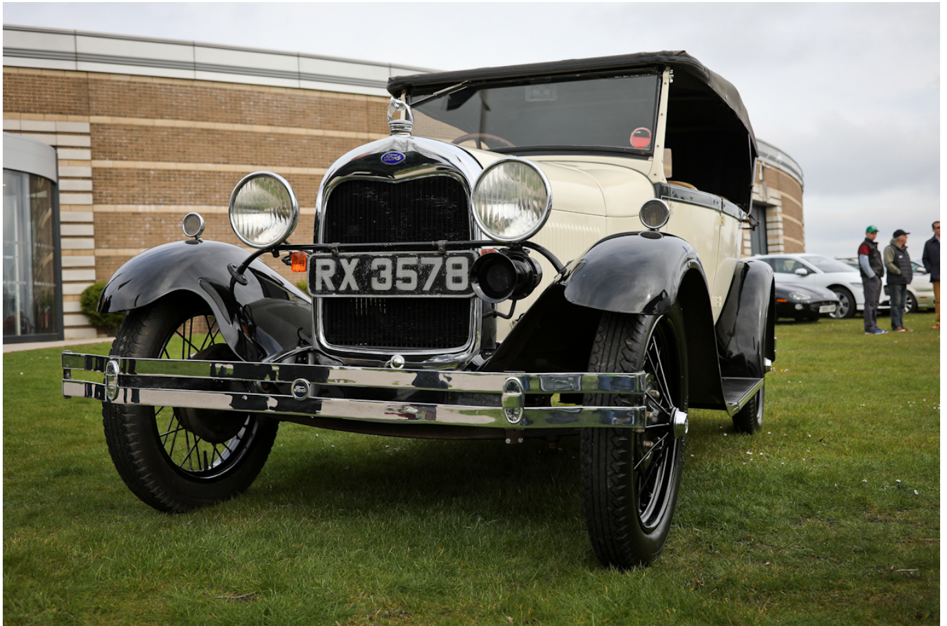
1929 Ford Model A Phaeton.