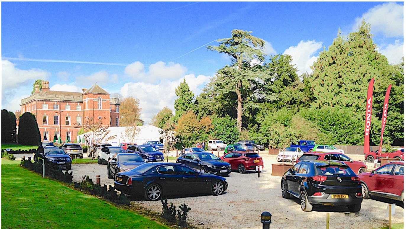
Some of the cars available at the SMMT Test Day South 2017; photo courtesy Jeremy Walton.

https://www.wheels-alive.co.uk/brief-impressions-cars-driven-at-the-society-of-motor-manufacturers-and-traders-test-day-south-2017/