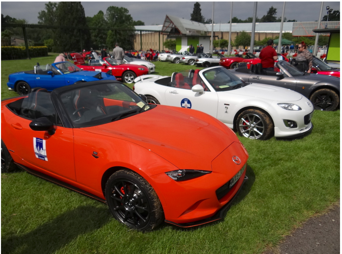
The Mazda MX-5 Owners' Club celebrating 35 years of this modern classic.

Armstrong Siddeleys, Austin Tens, Austin A30/A35 models, Ford Cortina Mark Is, Maestros and Montegos, Mazda MX-5s (a celebration of 35 years of this modern sports car classic), Morgans, Rovers, Saabs, Singers, Standards, Triumphs and pre-War Wolseley Hornets, among many others.