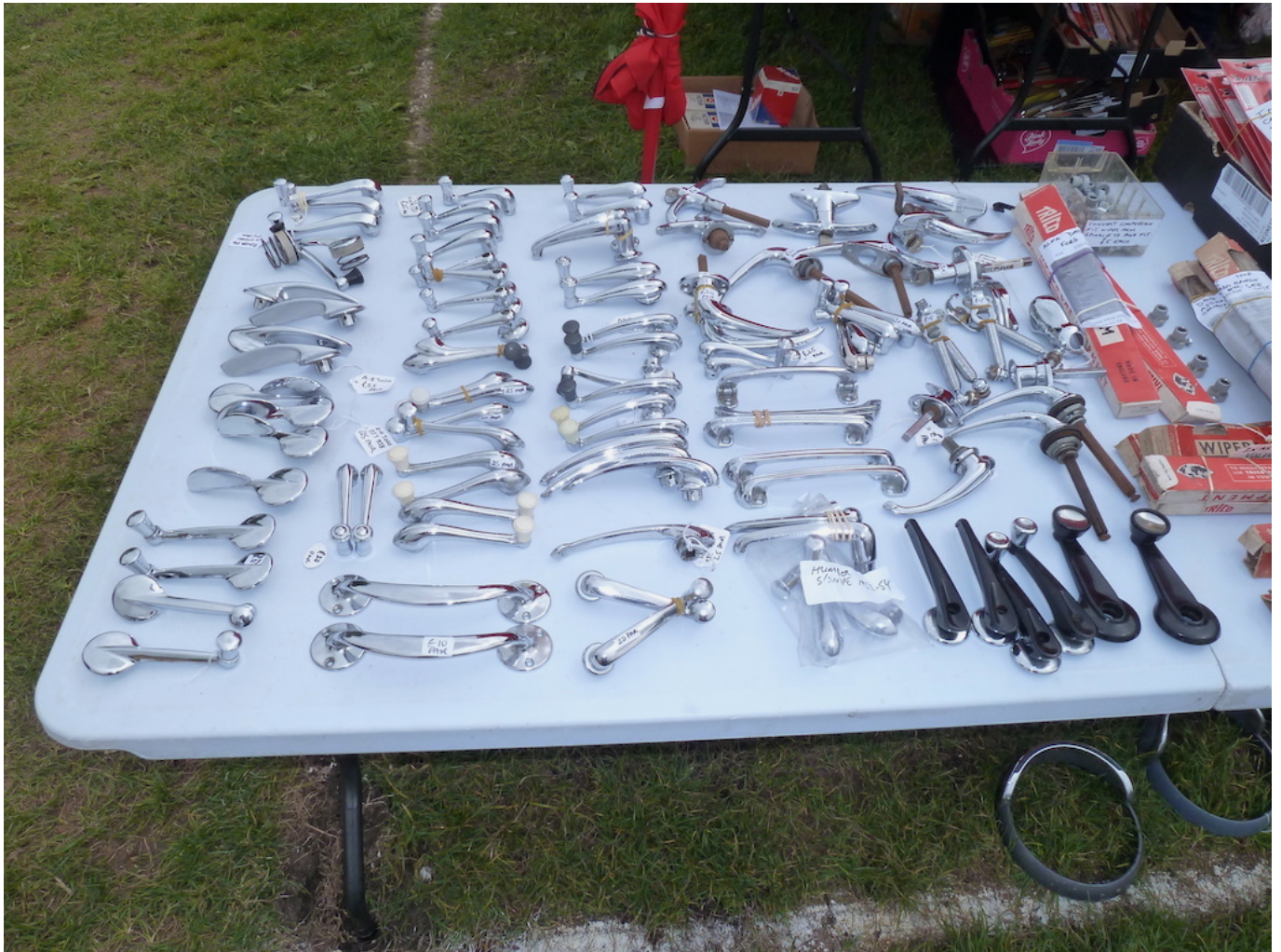
New door and window winder handles for many classics here.