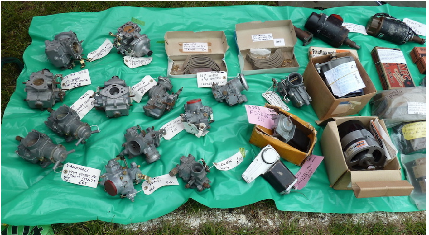
Rare carburetors and brake shoes/linings, alternators and wiper motors were on this stall.