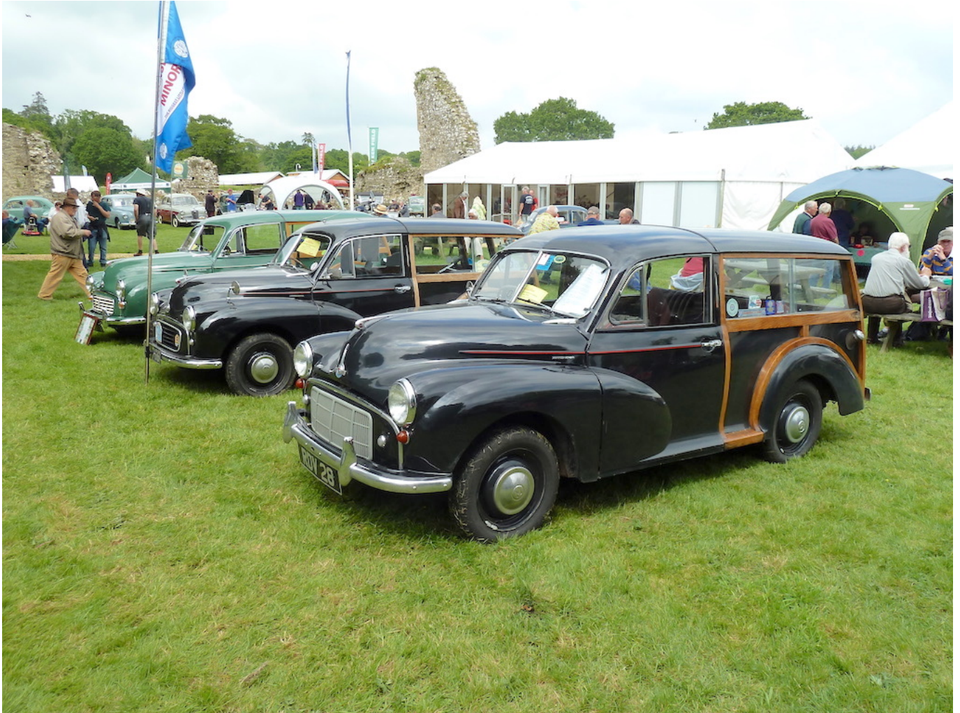
Three 'splitscreen' Minor Travellers lined up together.