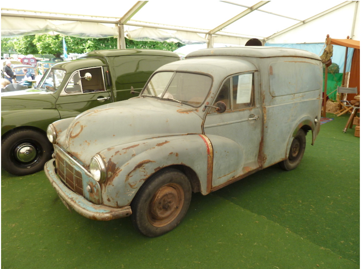
The oldest surviving Minor van, dating from 1953.