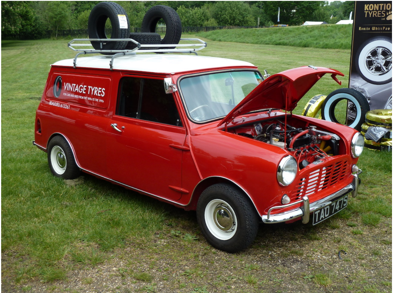
This lovely Mini van is a great advert for Vintage Tyres, based at Beaulieu.