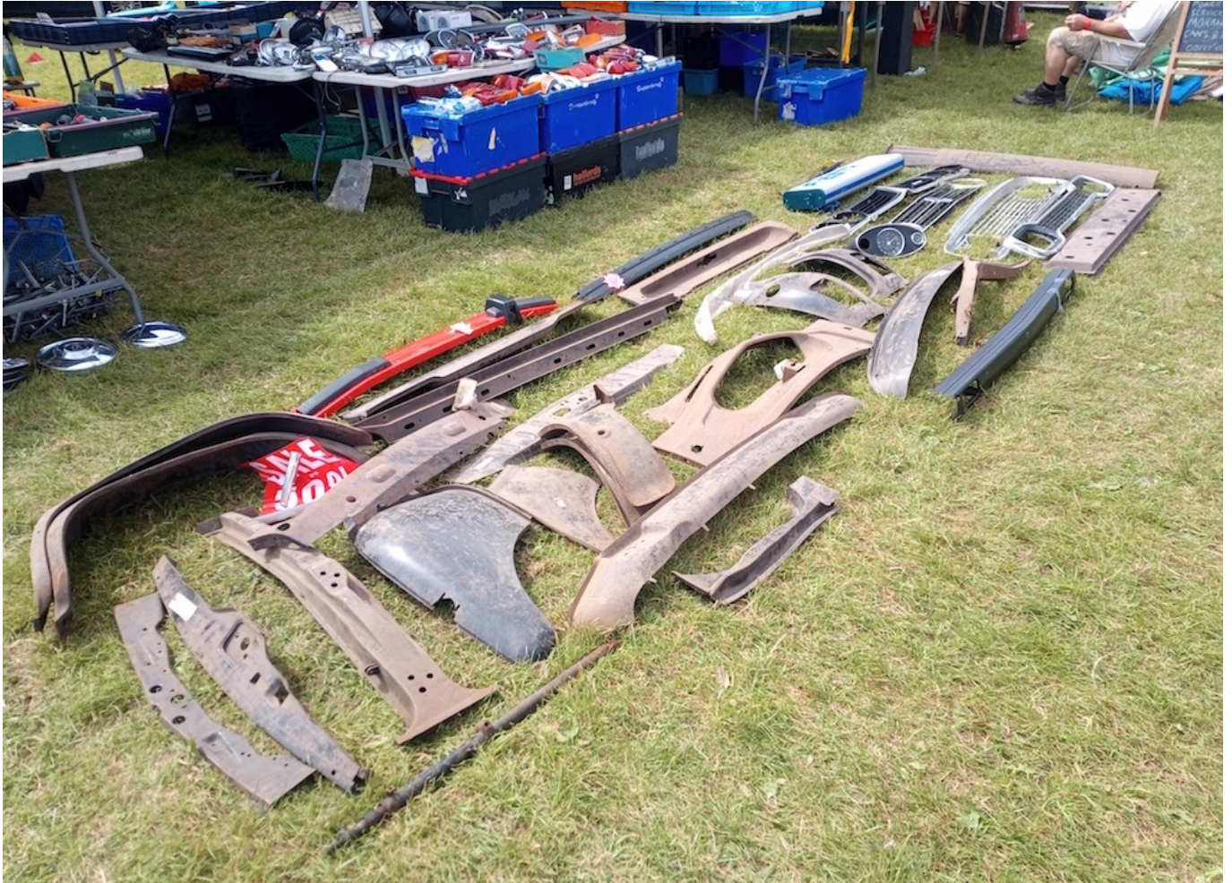
A multitude of 'new old stock' body panels...