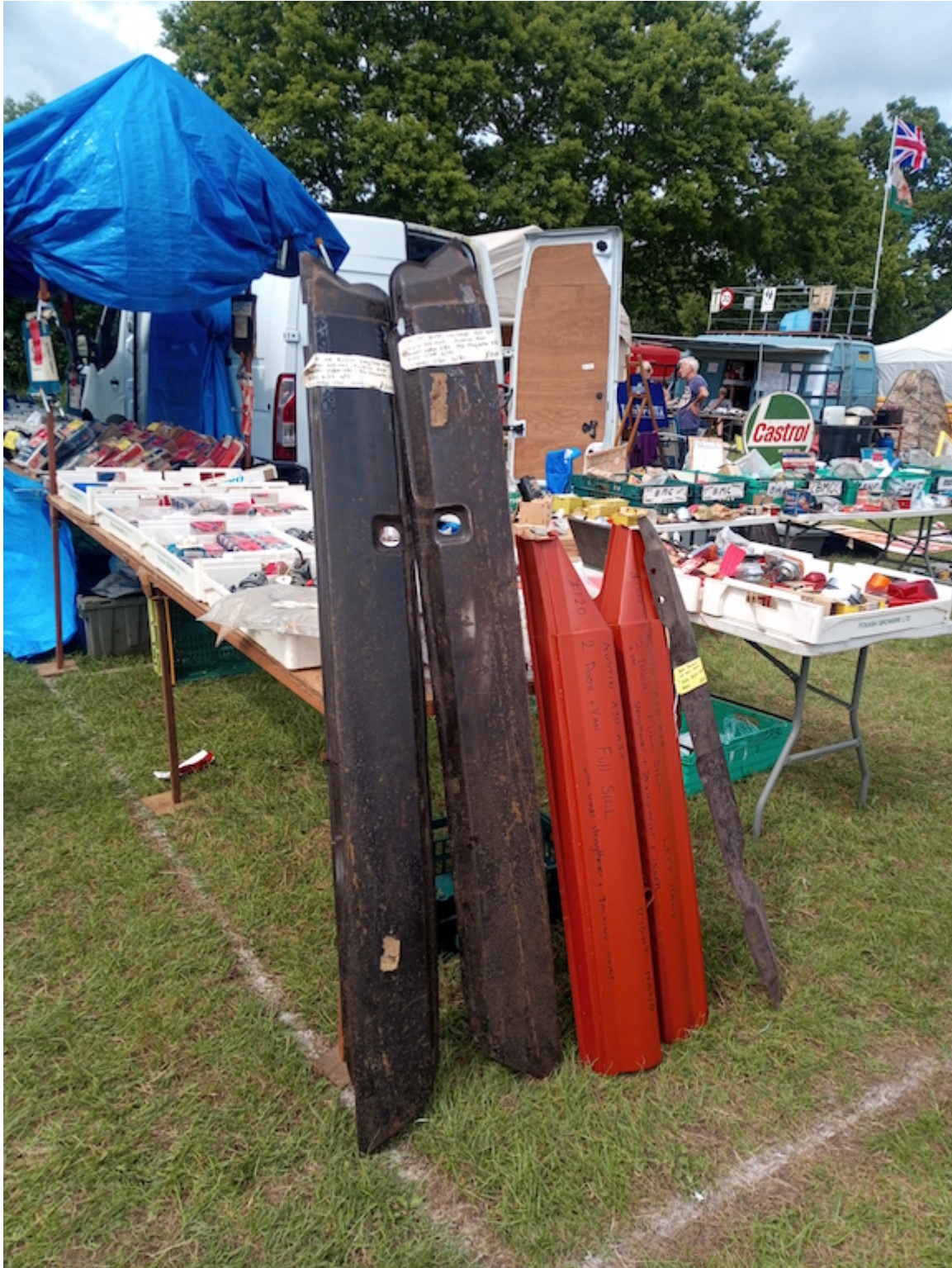
Original BMC sill panels (£200 each) for the 1.5/1.6 litre Farina range (plus