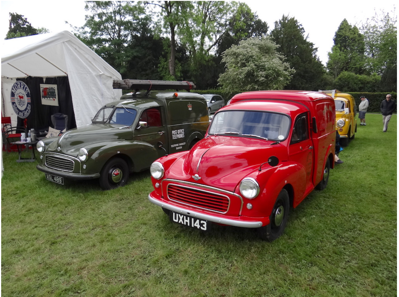
Post Office Telephones Minor and Royal Mail Minor 1000 liveried vans side by side at 'Moggyfest'.

In total there were more than 200 Minors and contemporary classics on display in the Moggyfest area.