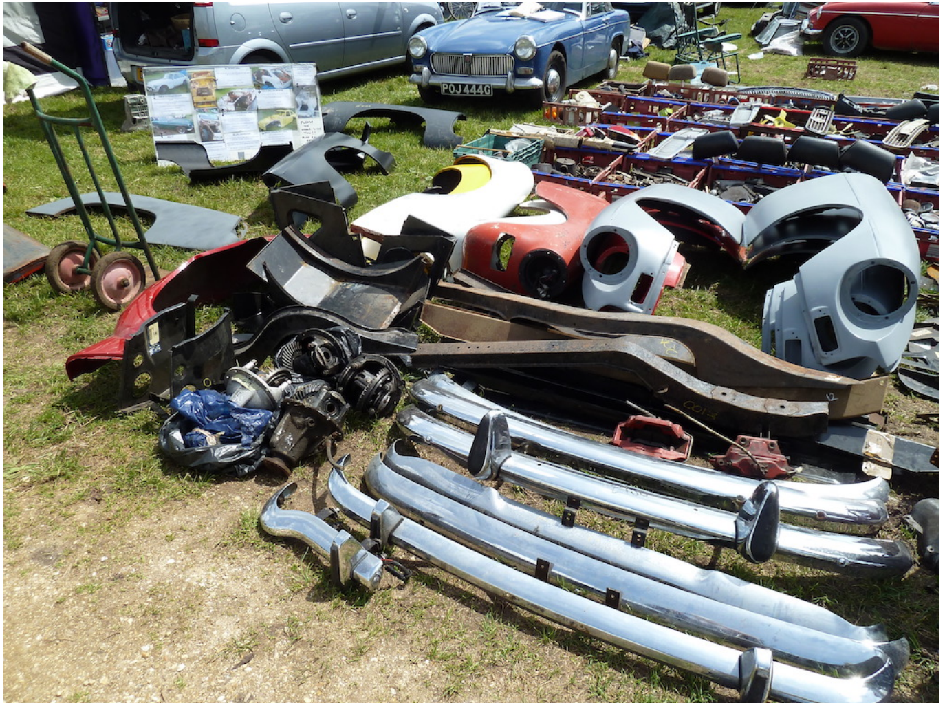
MG bodywork and mechanical items in quantity...