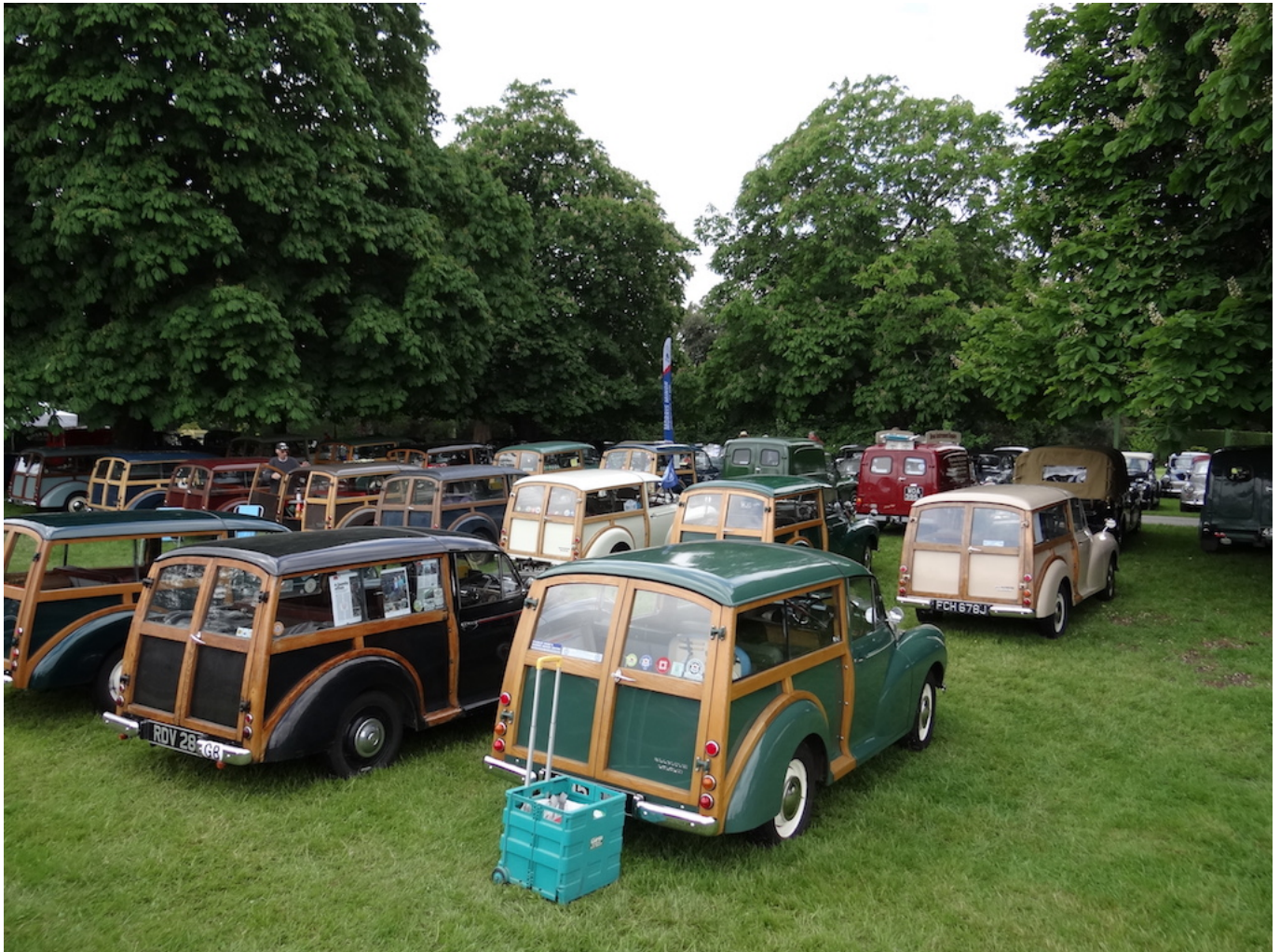
Travellers galore resting at Beaulieu.

Notable again this year was the very special 'Moggyfest' display organised by the Dorset Morris Minor Owners' Club. Without exception, they always put on a superb display, and this year's main theme was a brilliant celebration of 70 years of the Minor Traveller and light commercials (vans and pick-ups). The display included the oldest Minor van known to survive, a 1953 example shown in 'as found' bodywork condition (but with sound chassis and mechanical aspects). I was also drawn to a lovely line-up of three 'split screen' Minor Travellers; these are rarely encountered these days so it was great to see three together.