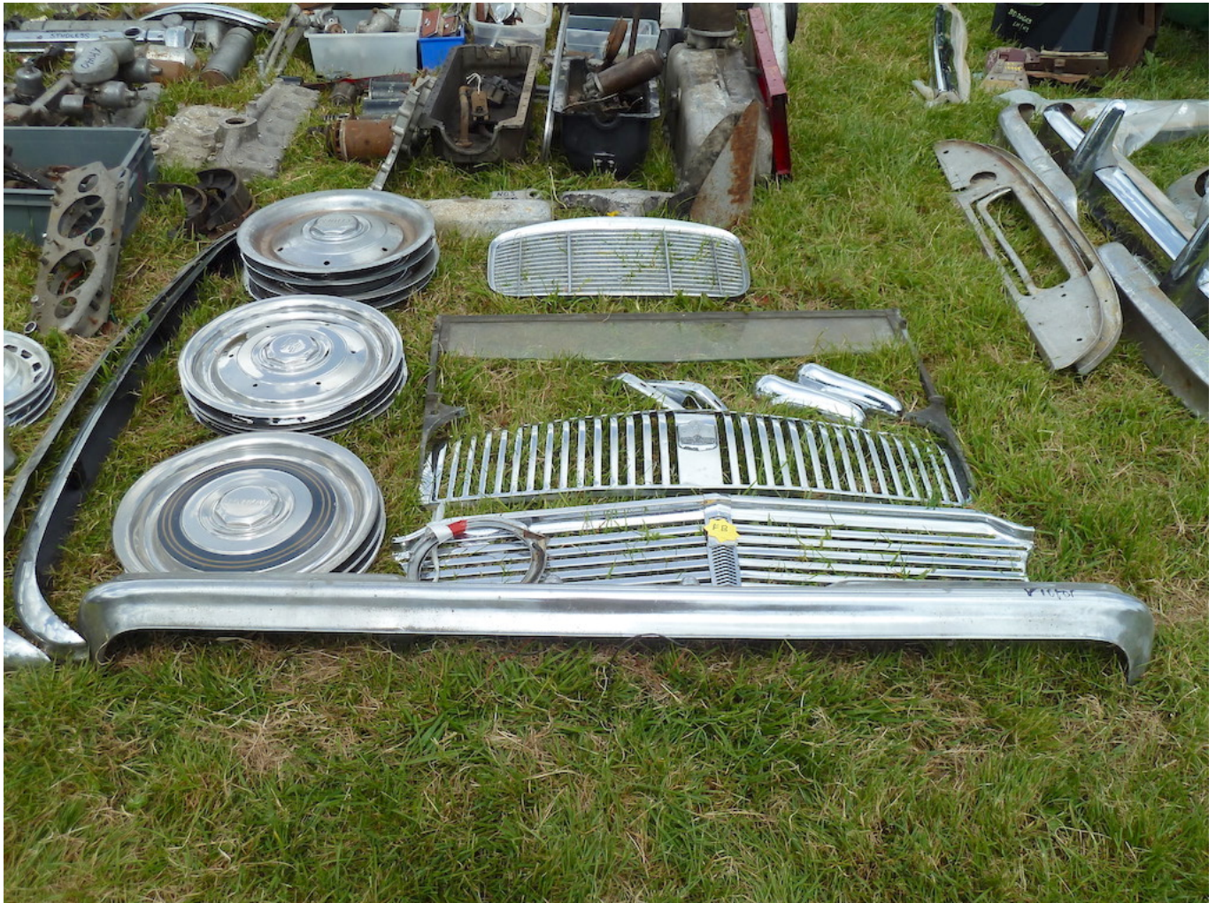
Unused Consul Mark I grille, plus Victor FB grille and front bumper.