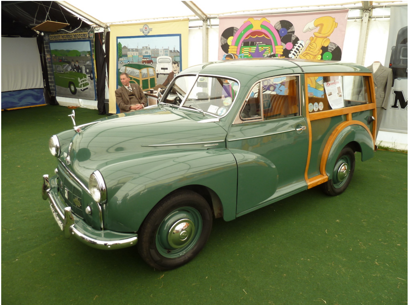
A Morris 'salesman' awaits customers for the new Minor Traveller in the dealership display within 'Moggyfest'.