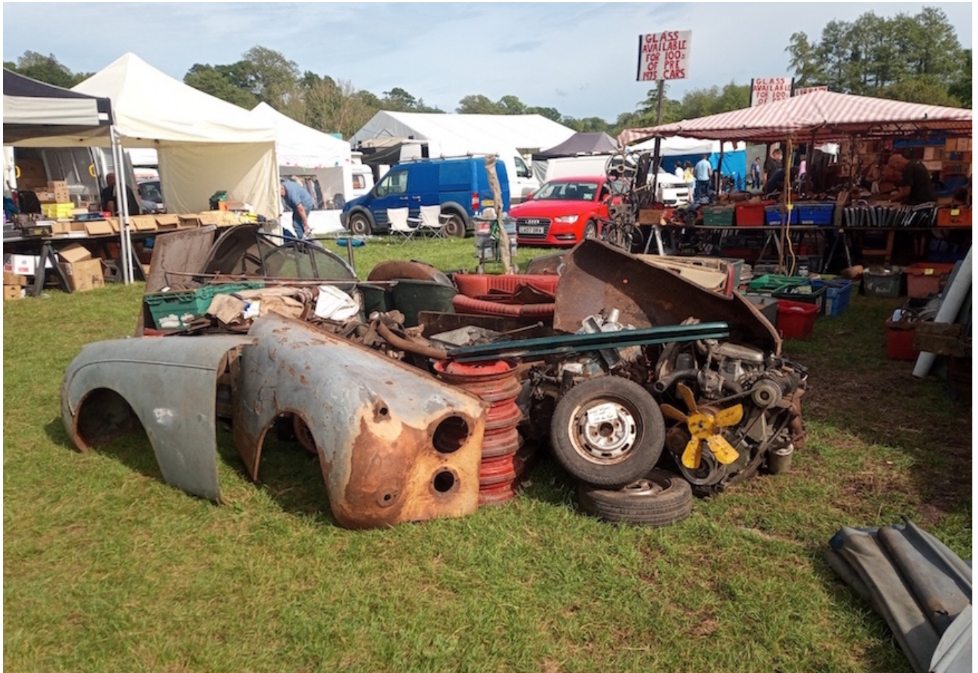
Do-it-yourself Jaguar kit?