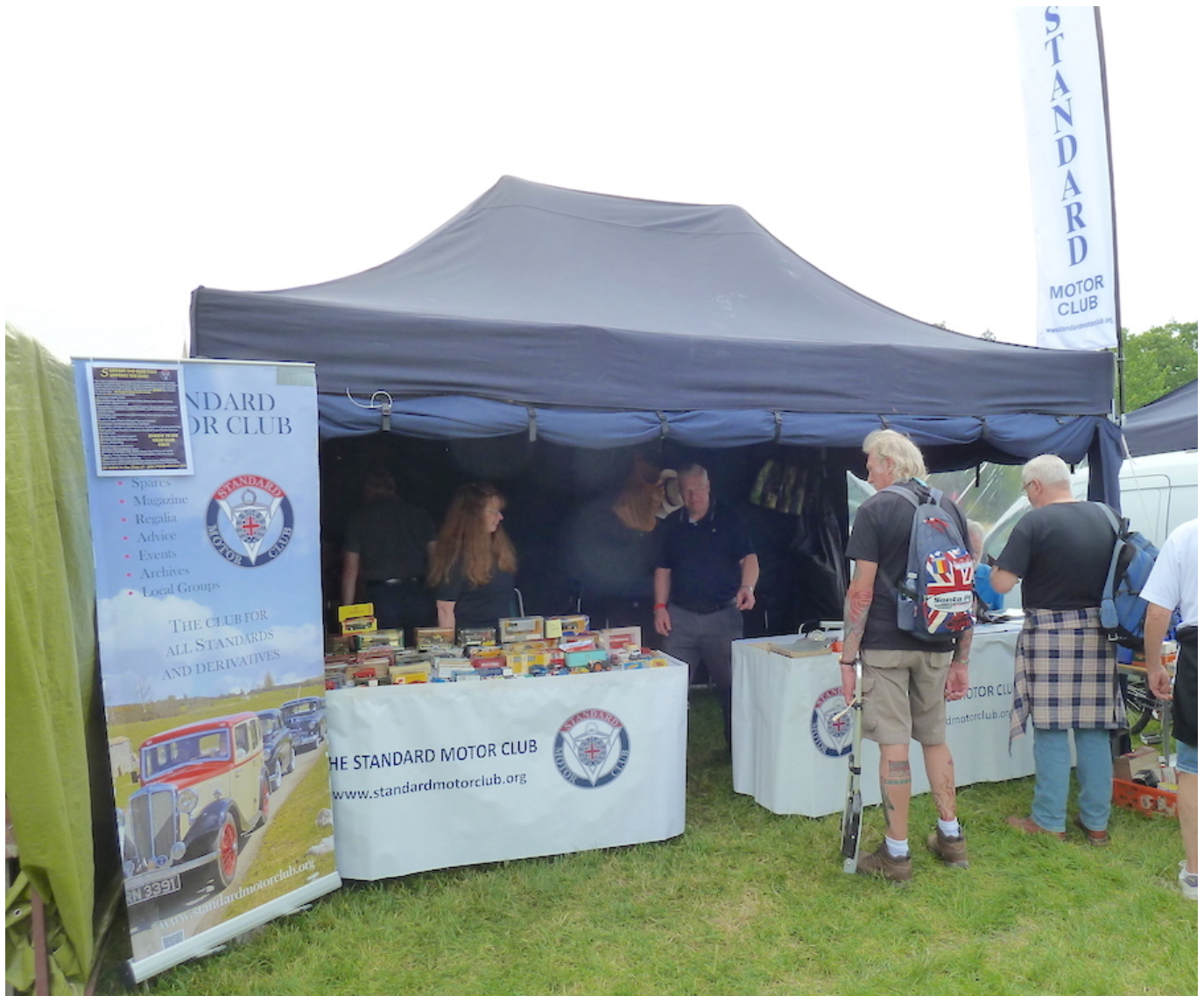
The Standard Motor Club stand attracted much interest.