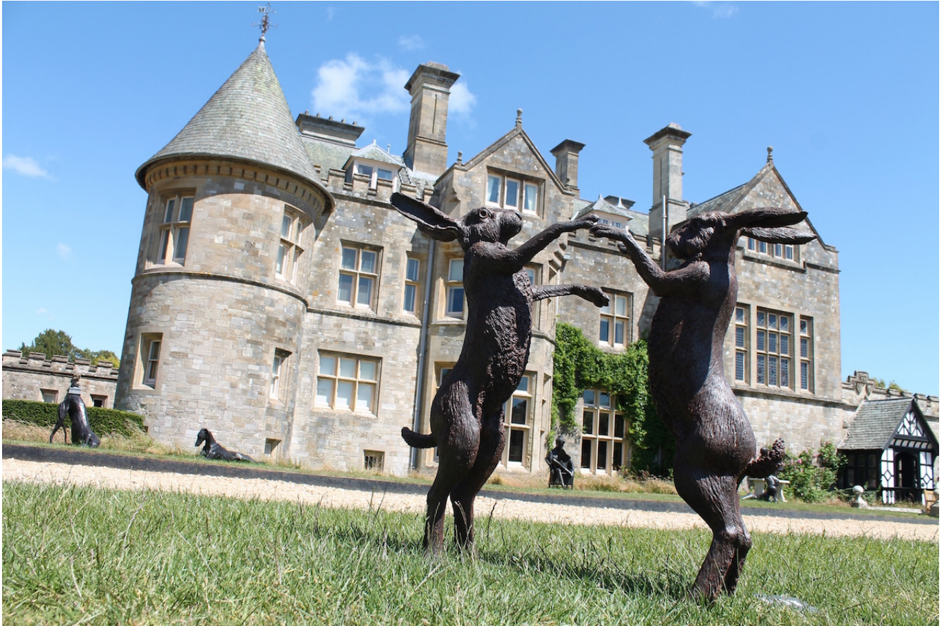
Sculpture at Beaulieu.

See new exhibition: Motopia? Past Future Visions