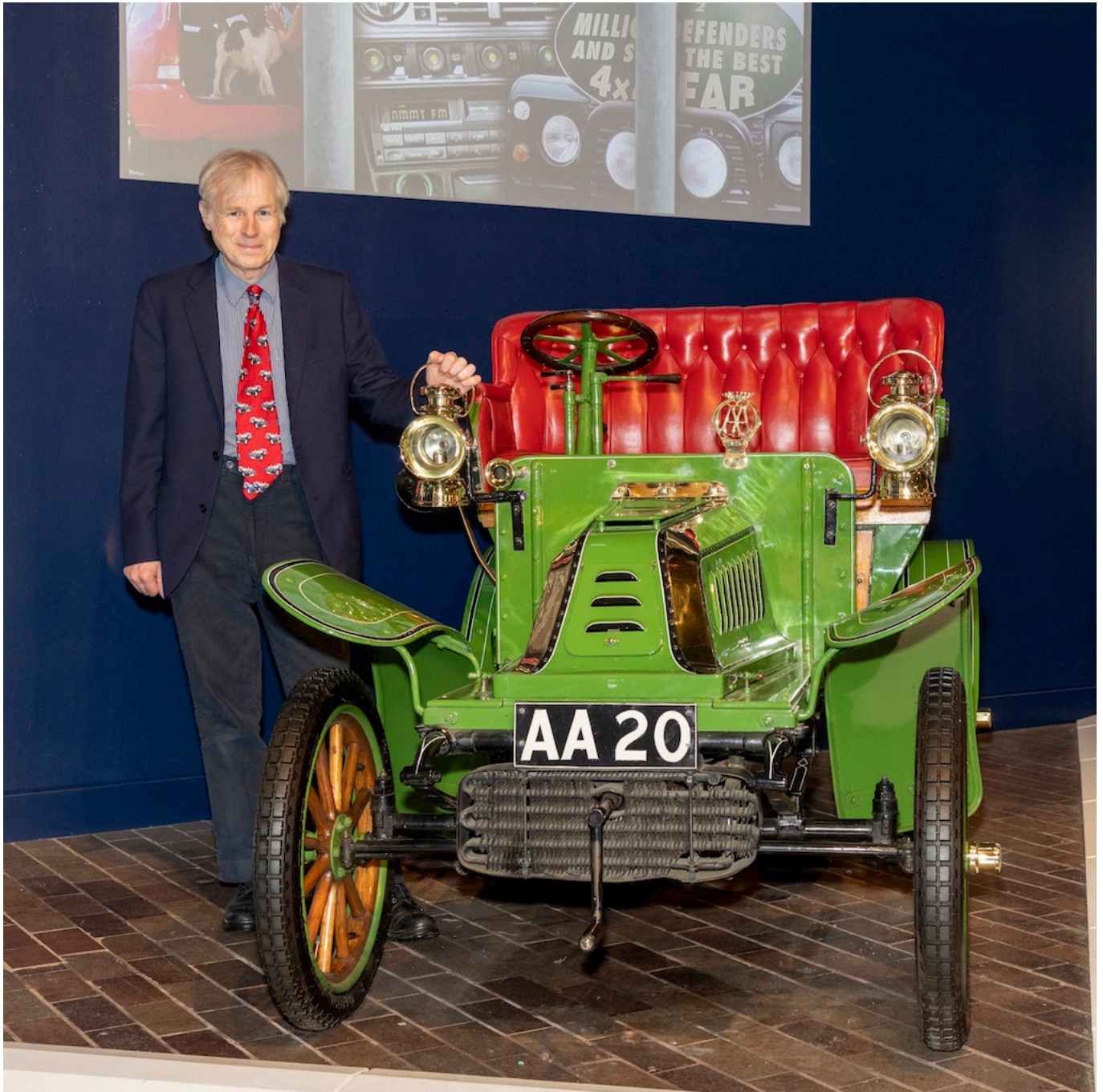
Lord Montagu with the 1903 De Dion Bouton that started the collection.

To celebrate the 50 th anniversary of the National Motor Museum , explore the exhibition telling The Story of Motoring in 50 Objects from now until April 16 th .