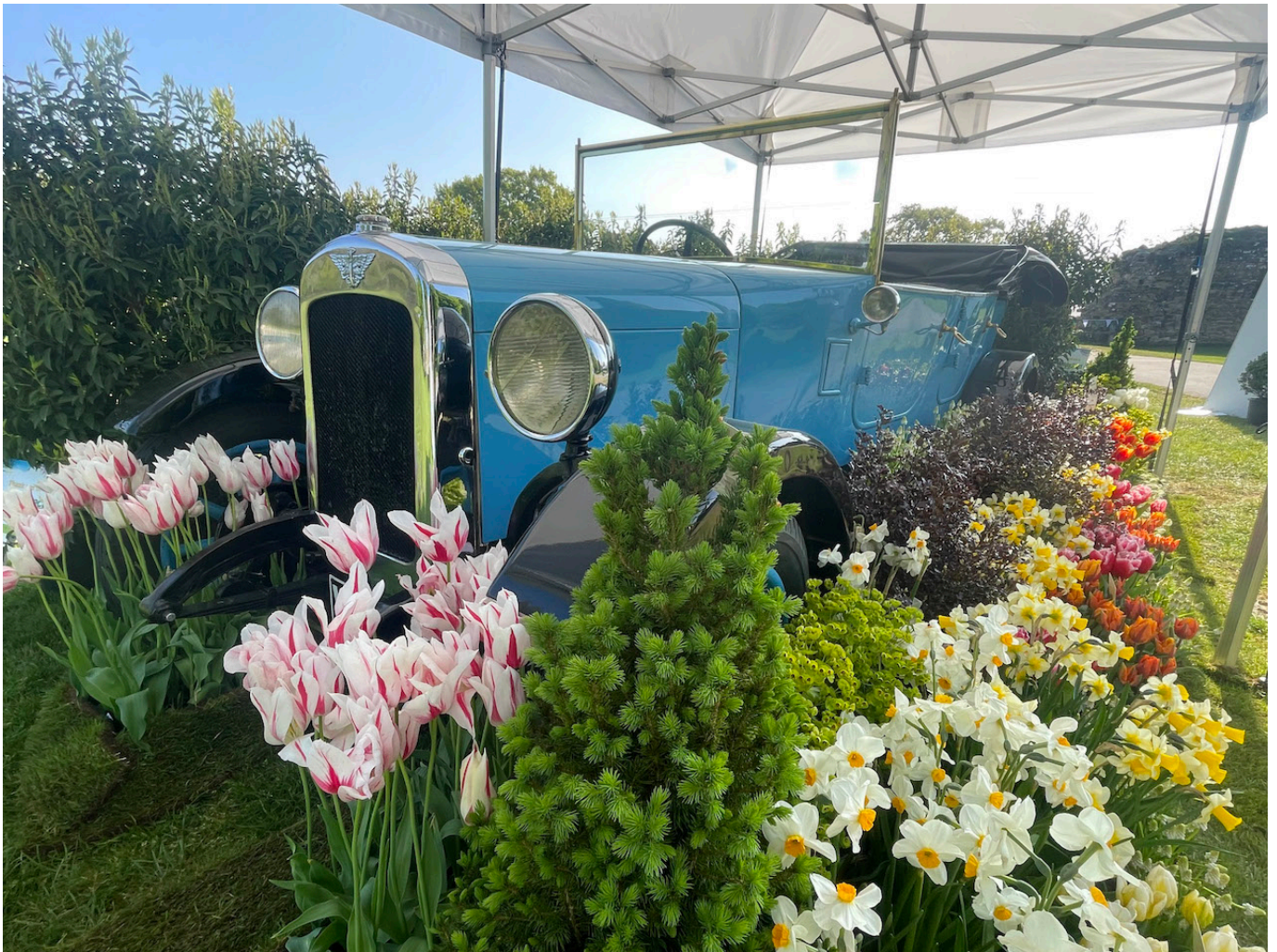
BBC Gardeners' World Spring Fair

Online version: https://www.wheels-alive.co.uk/beaulieus-big-plans-for-the-future-revealed/