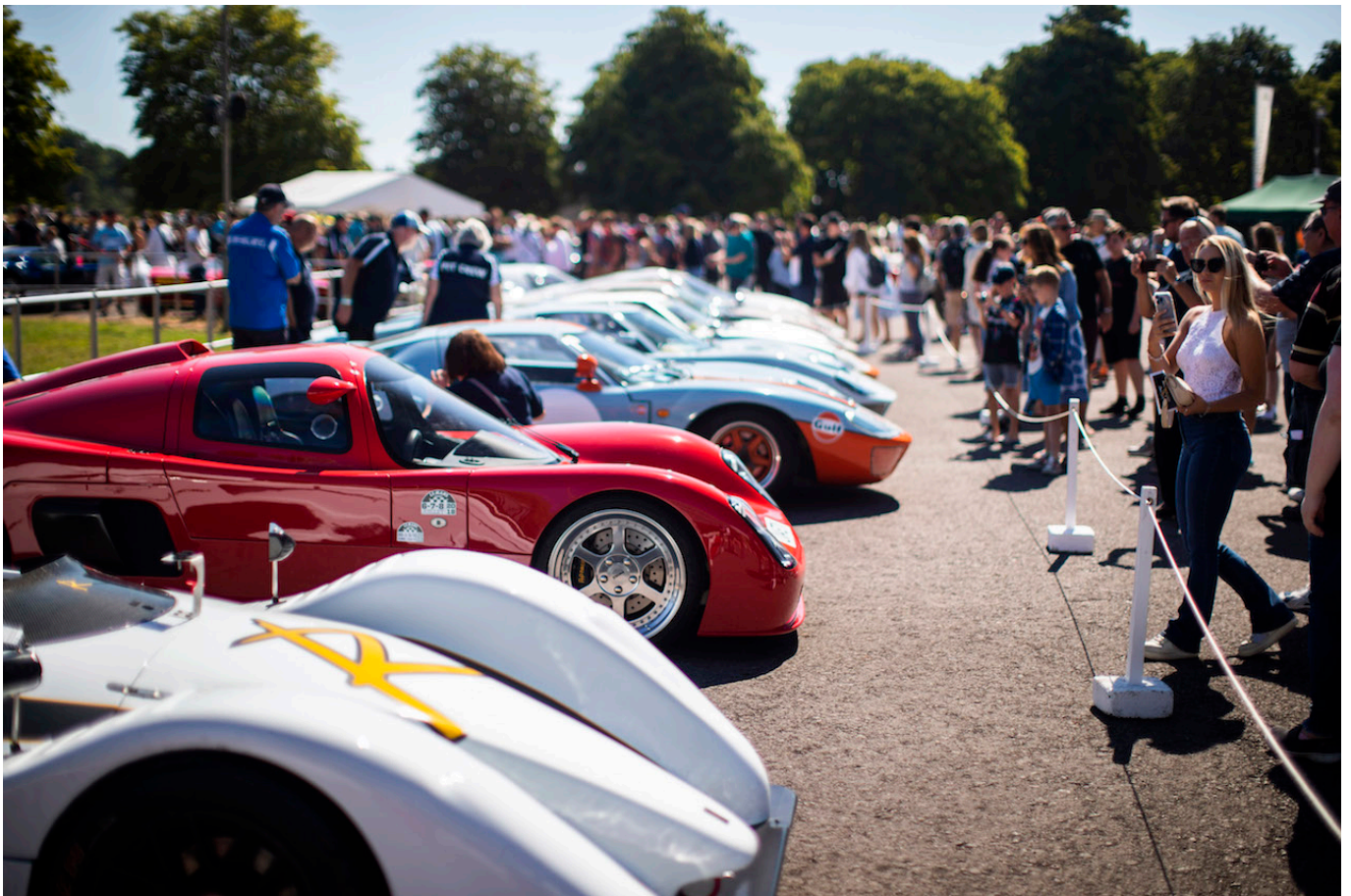
Beaulieu Supercar Weekend.

Following its successful return in 2022, Spring Autojumble will be back on May 13 th and 14 th followed by the UK's biggest autojumble, award-winning International Autojumble on September 2 nd and 3 rd - which will be packed with classic spare parts and cars for sale,