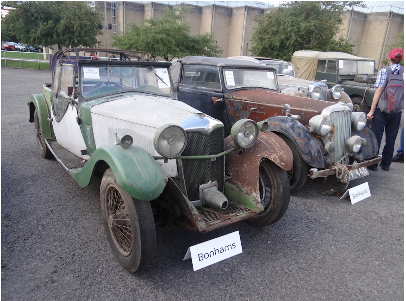
On the left is a Riley Lynx Tourer project, which fetched £4,025, next to a Rover 20 Tickford Fourseom Drophead Coupé, sold by Bonhams for £5,520.