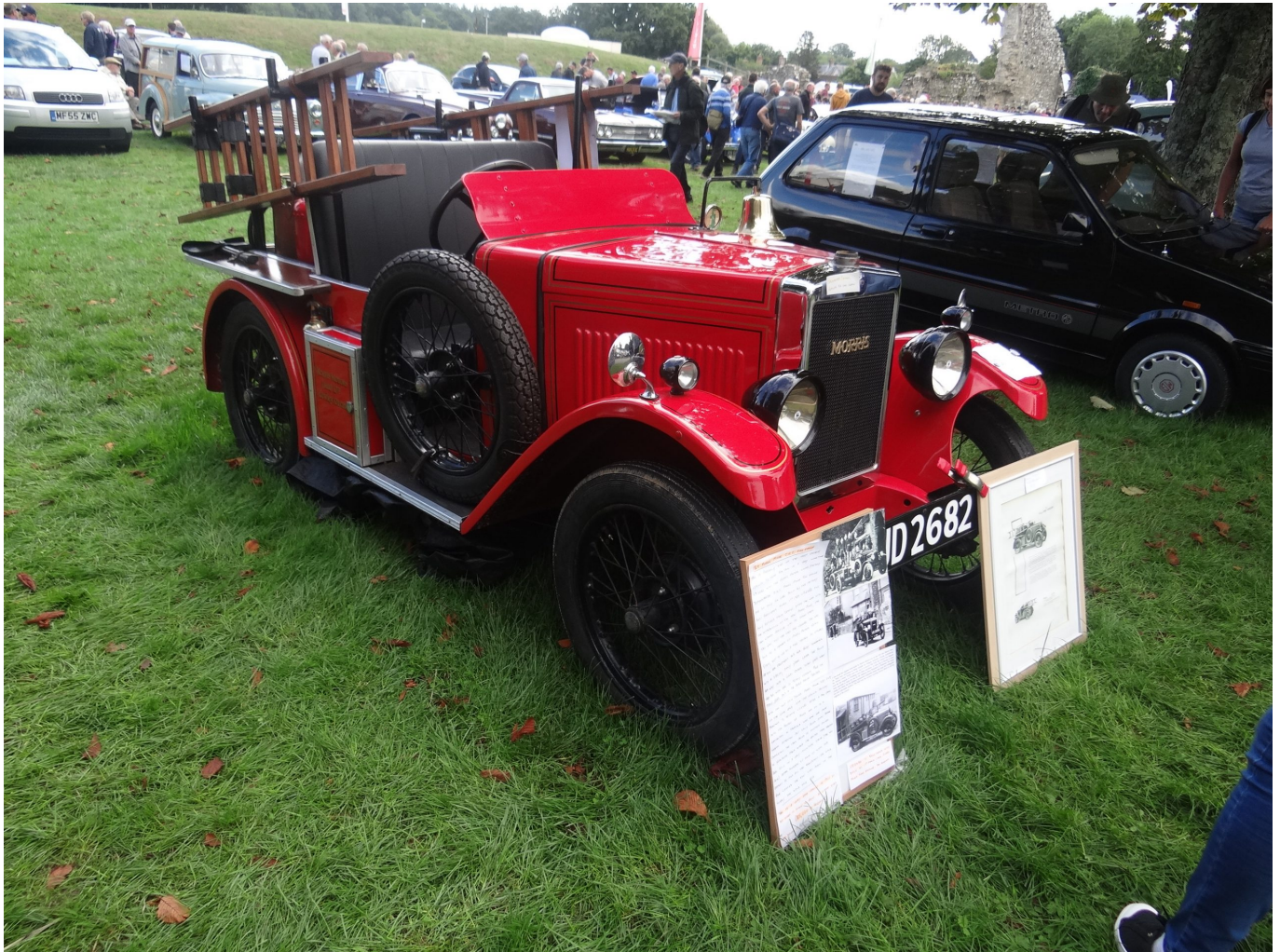
Offers above £25,000 were sought for this 'one off' overhead camshaft 1929 Morris Minor based fire engine.