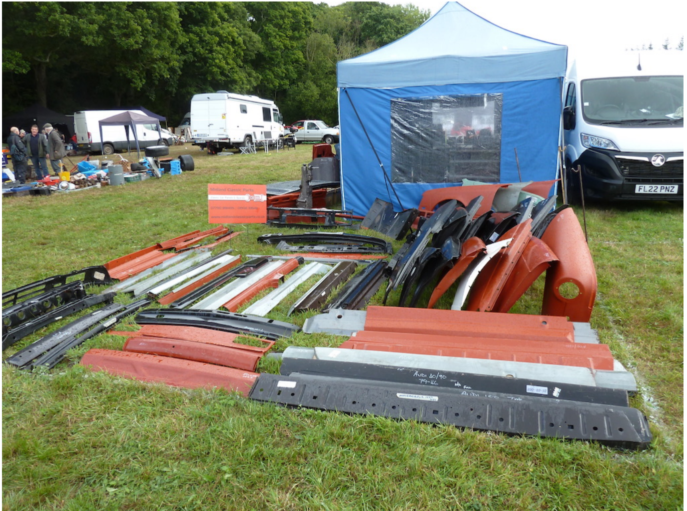
This is where I found a pair of sill panels for my A55 Cambridge.