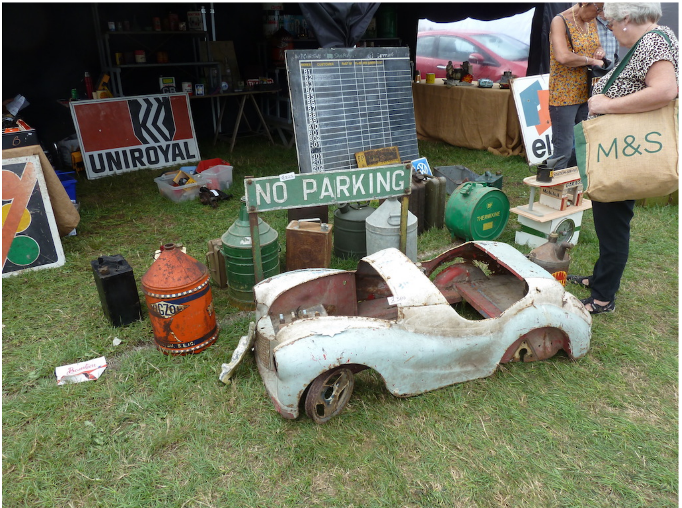
An Austin J40 pedal car in need of t.l.c...