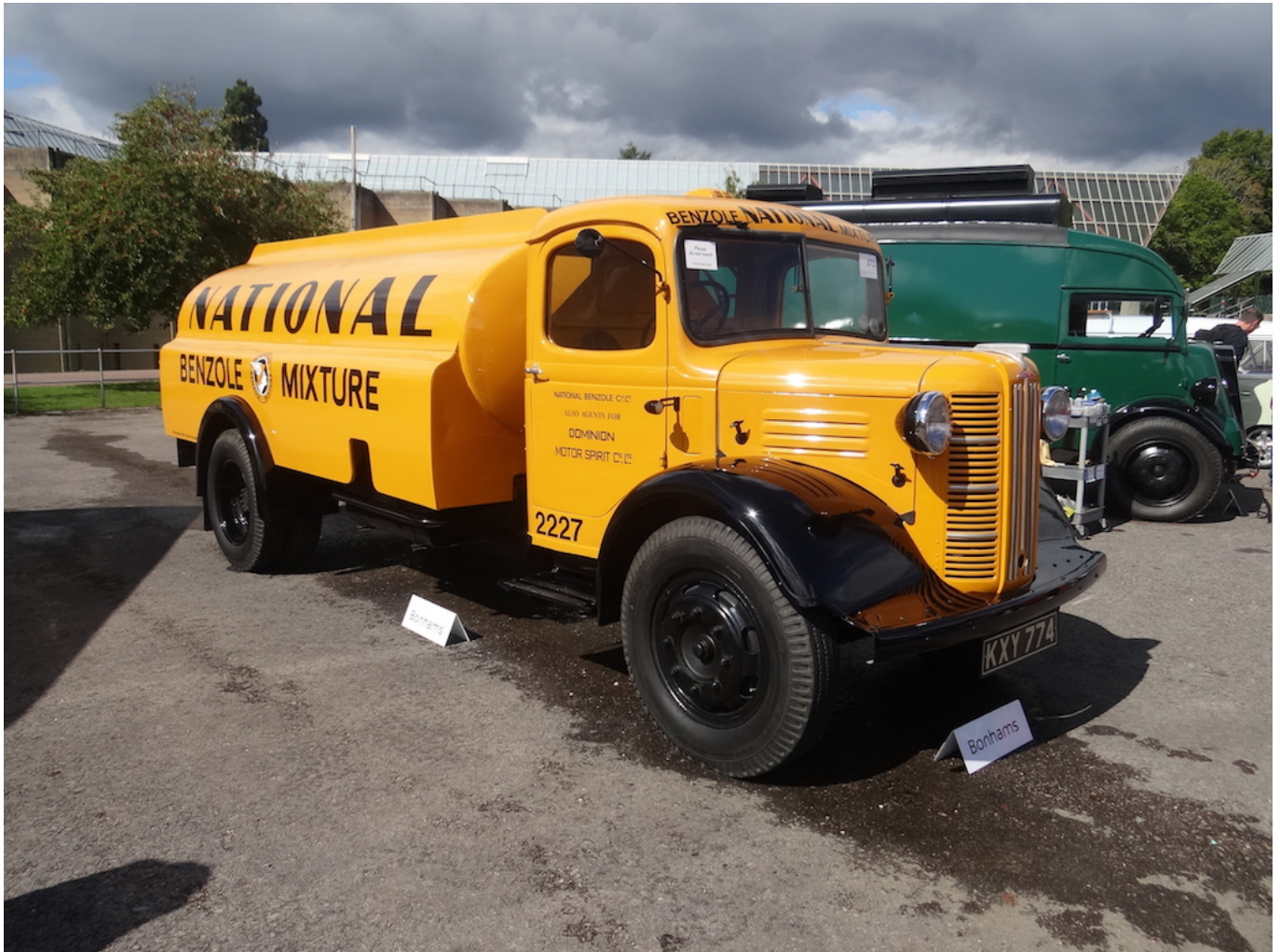
This wonderful 1950 Austin K4 petrol tanker carried a pre-sale estimate of £30,000 to £40,000, but sold for £24,725 in the Bonhams auction.