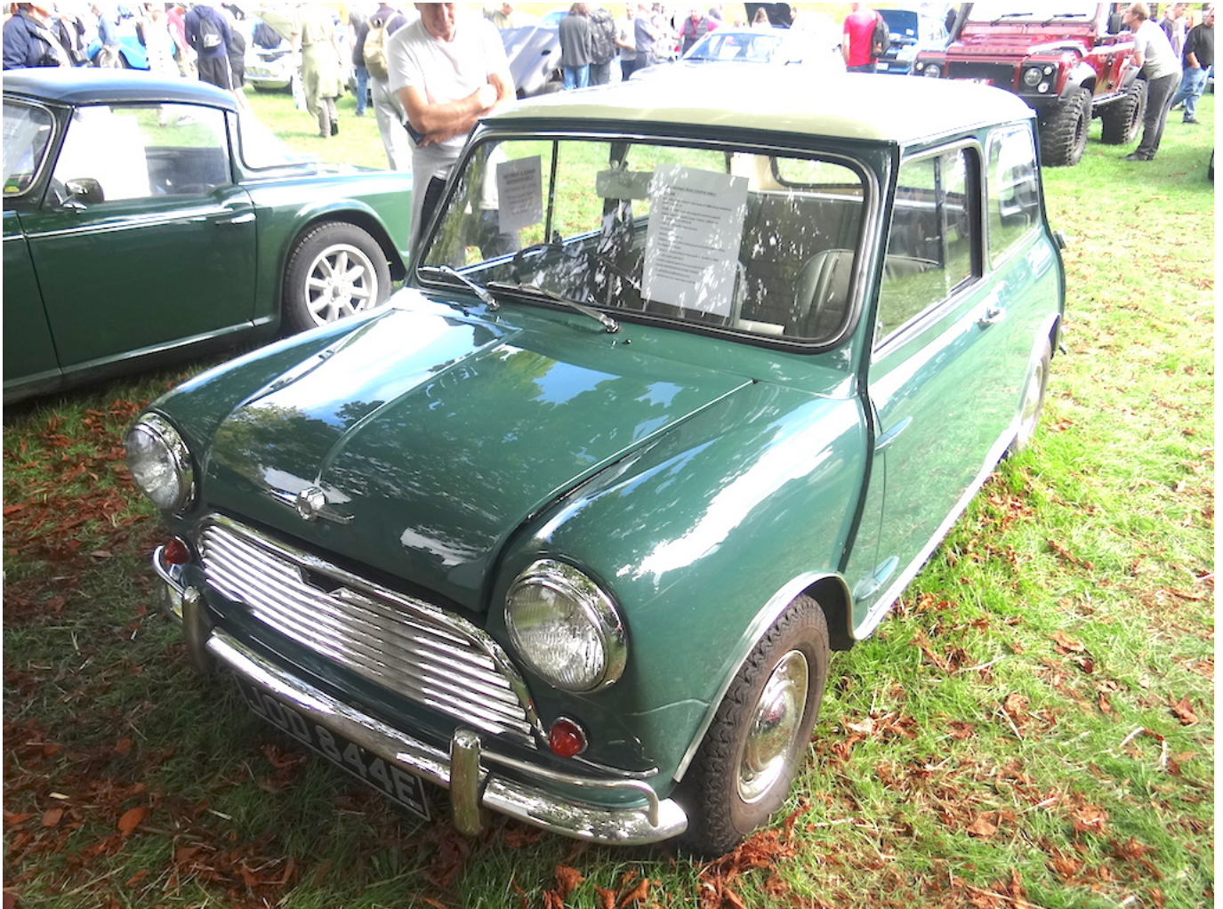
Dating from 1966, this recently restored Morris Mini Cooper was priced at £26,000.