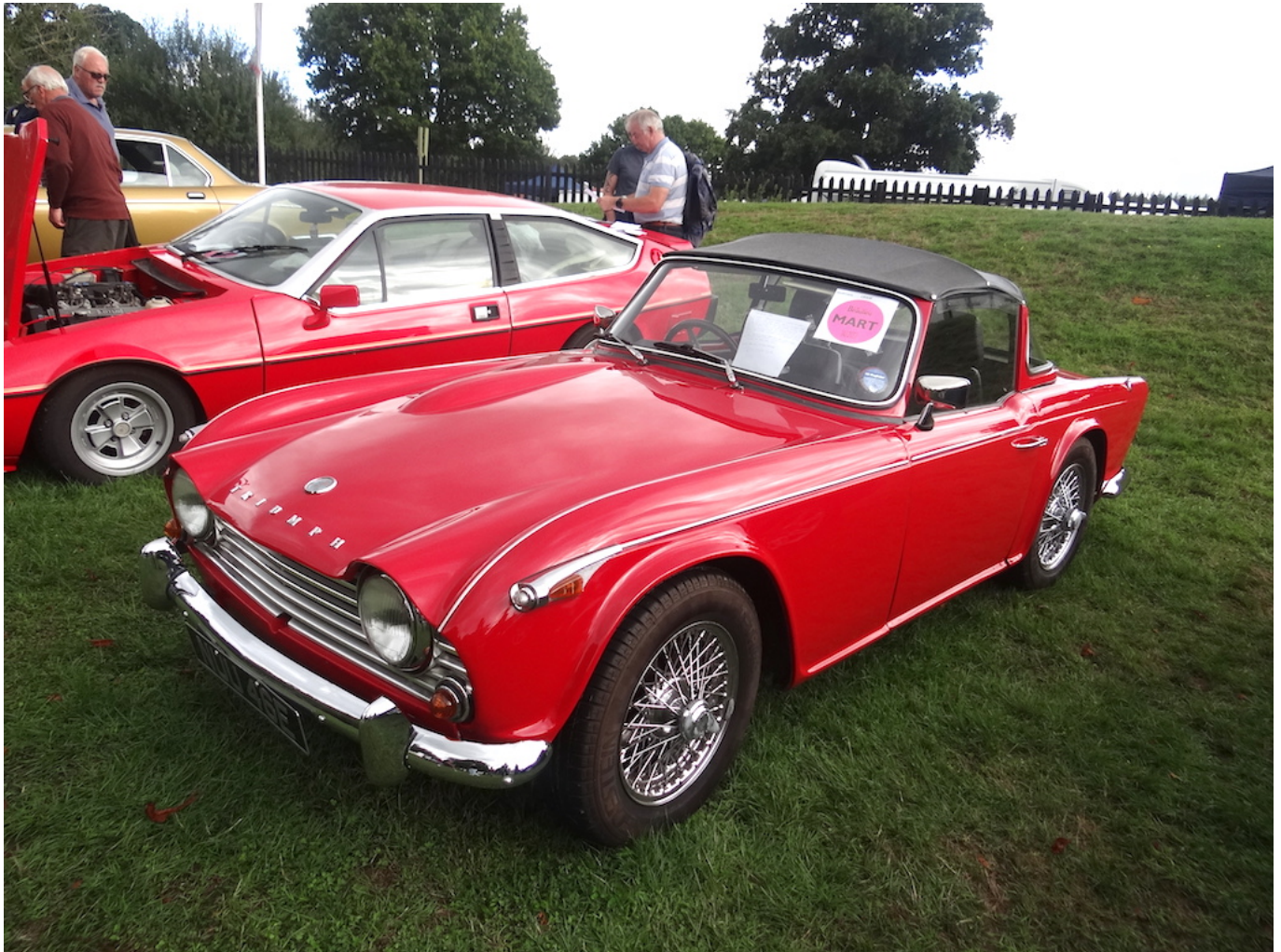
This updated Triumph TR4A in the Automart had a price tag of £26,000 o.n.o.