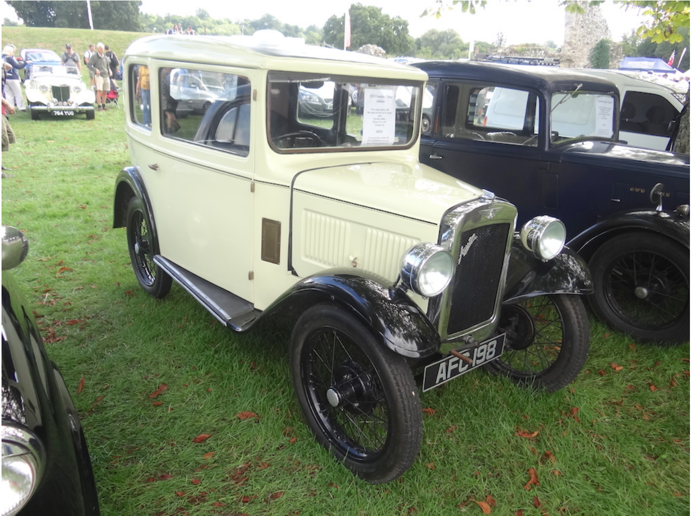
This two owner 1934 Austin Seven Box Saloon was wearing its 'factory' yellow colour, and was offered with a large history file. Price £8,250.