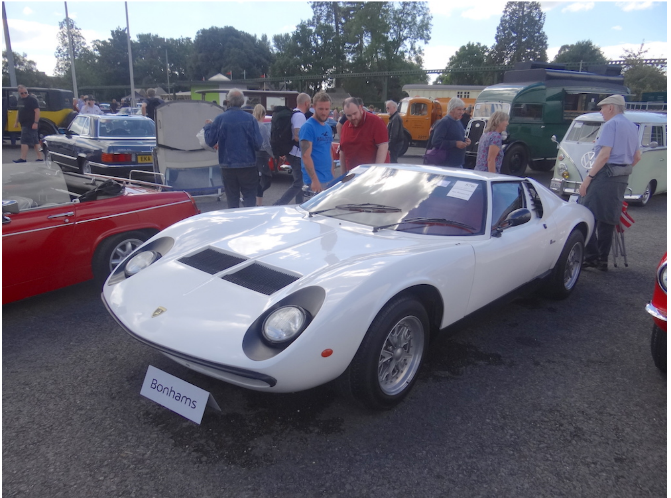
A 1991 Miura replica sports car by Prova Designs fetched £57,500 (pre-sale estimate £30,000 to £40,000).