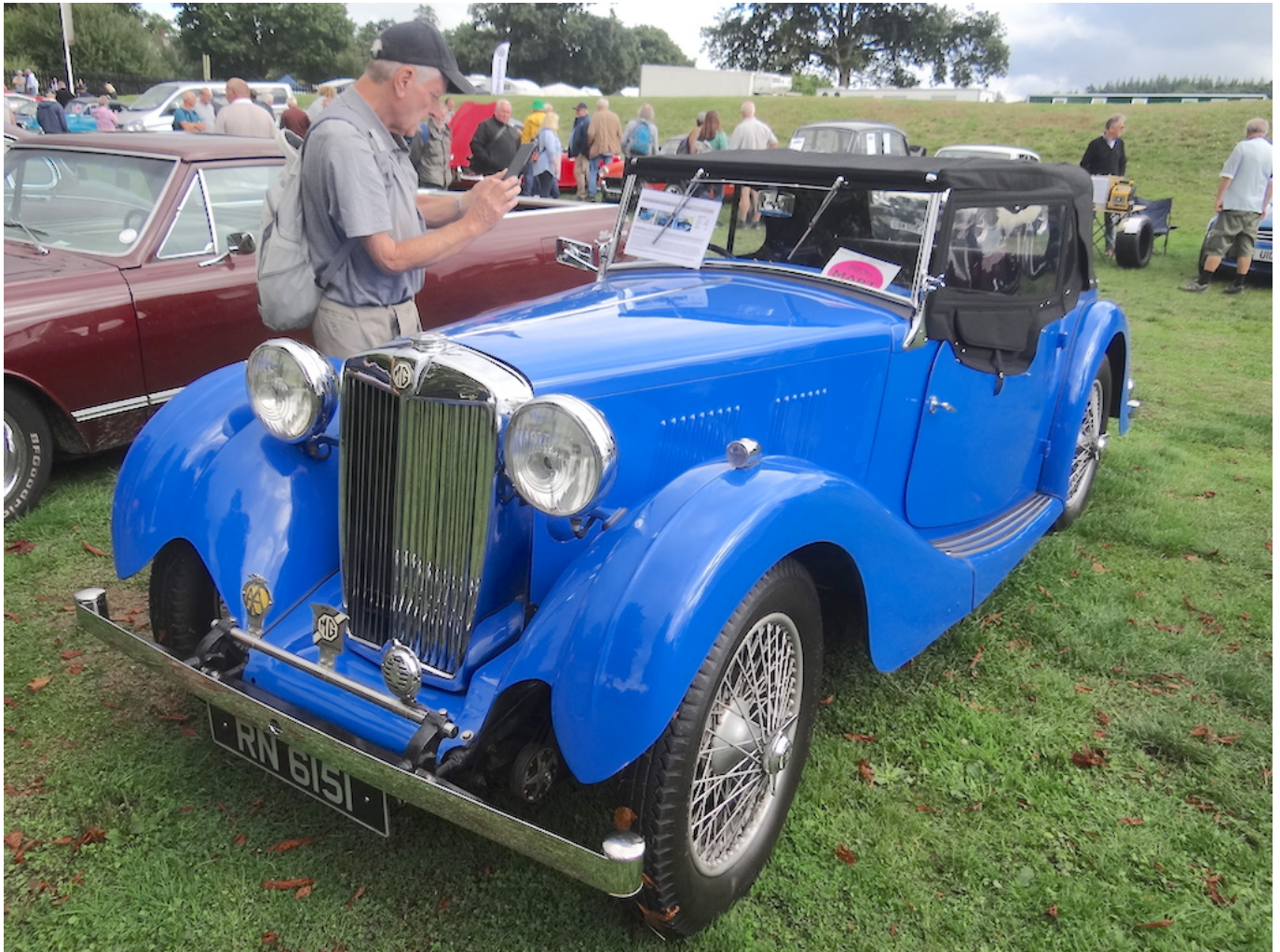
Fully restored, this lovely looking 1937 MG VA Tourer was in the Automart area and carried an asking price of £37,995.