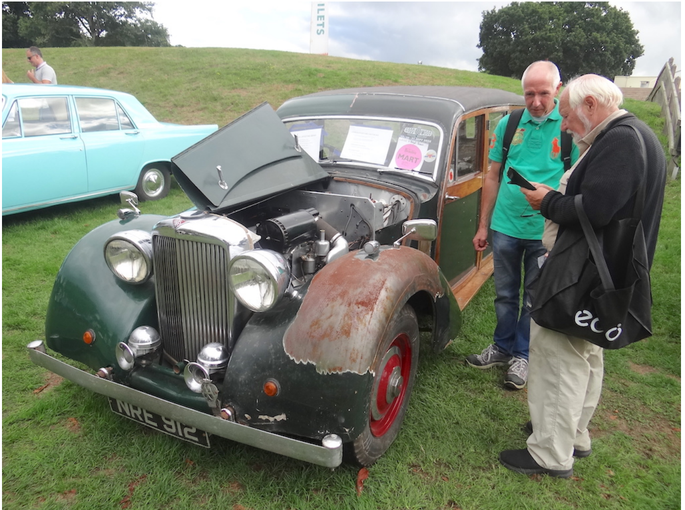
This rare 1947 Alvis TA14 Shooting Brake, for sale in the Automart section, has an interesting history. The asking price was £11,750 o.n.o.