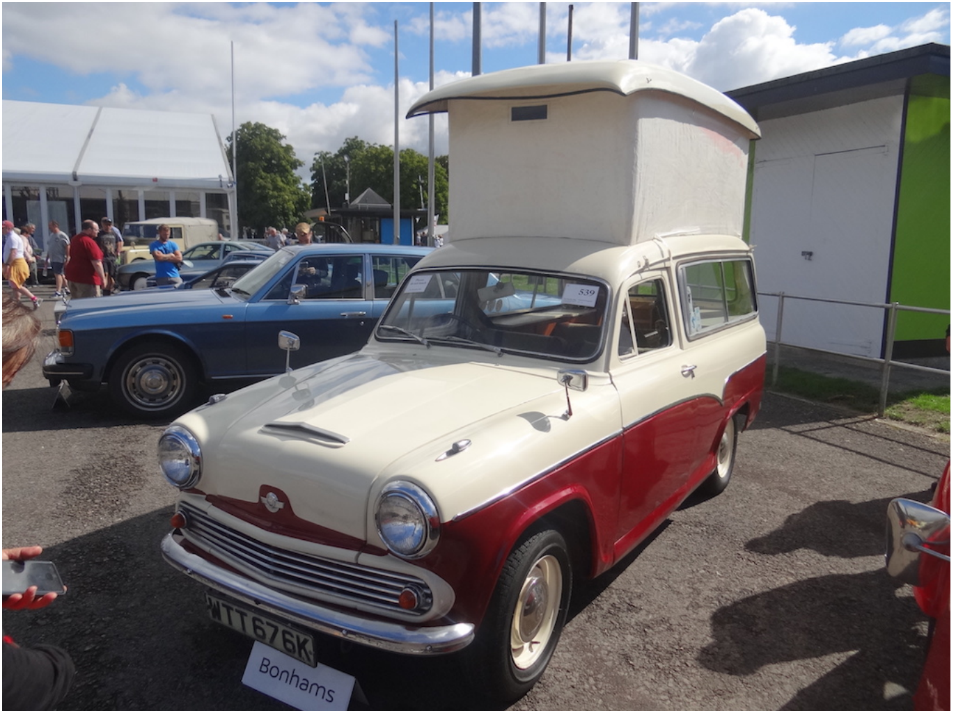
This 1972 A60-based but Morris-badged Sun-Tor camper had an estimate of £9,000 to £12,000 in the Bonhams auction, but was not listed as 'sold'.