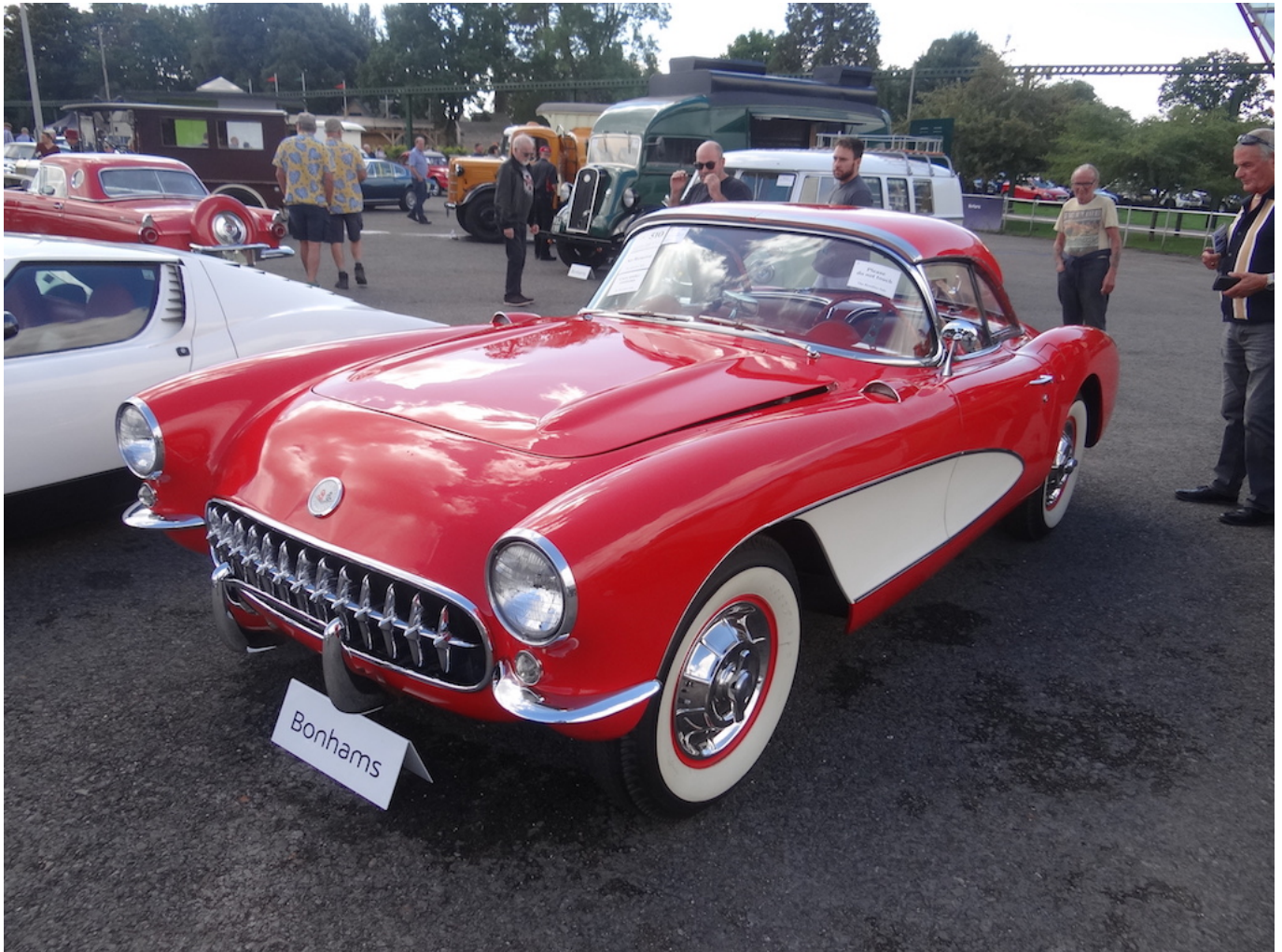
A '57 Chevrolet! This Corvette Convertible (with hard top) was sold by Bonhams for £55,200, against a pre-sale estimate of £40,000 to £60,000.