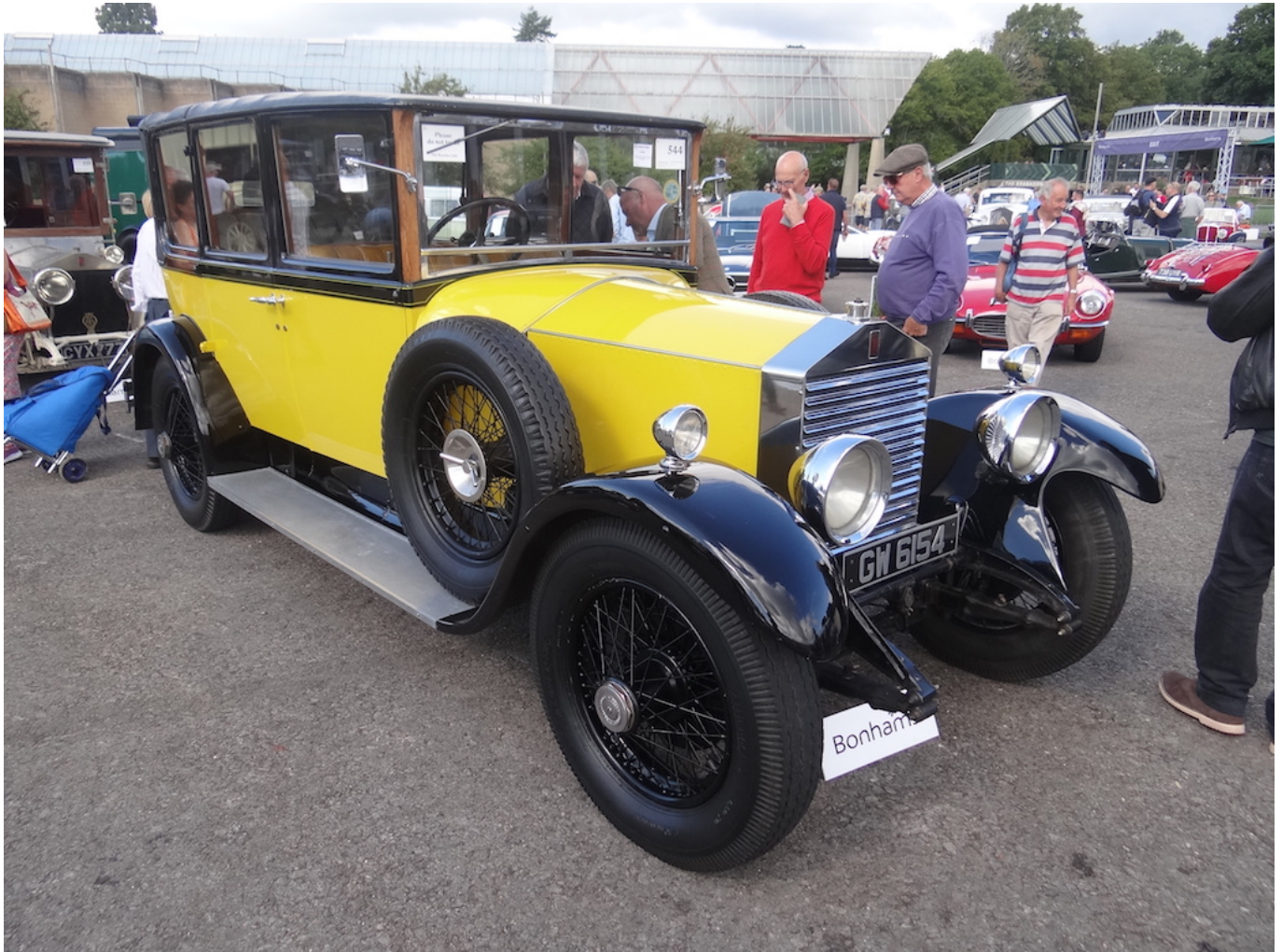
The auction estimate for this 1928 Rolls-Royce 20HP Landaulette had been £40,000 to £50,000, but it sold for £31,333,34.