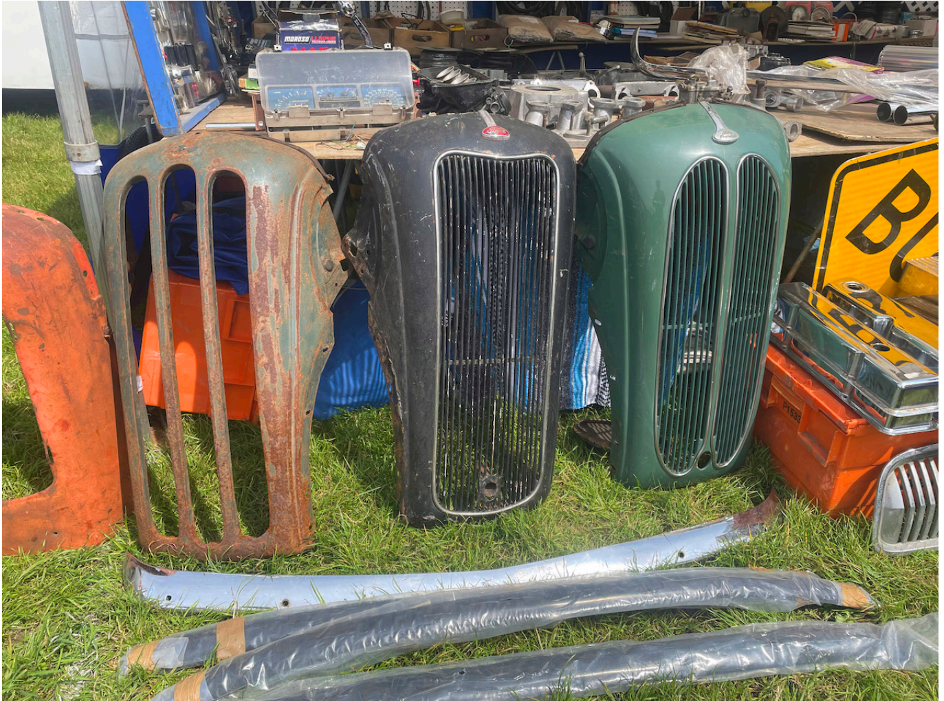
Spring Autojumble - Ford grilles galore seen here!

At International Autojumble on 14 th and 15 th September, there will be hundreds of stands to browse for bargains as part of a huge weekend of buying and selling action.