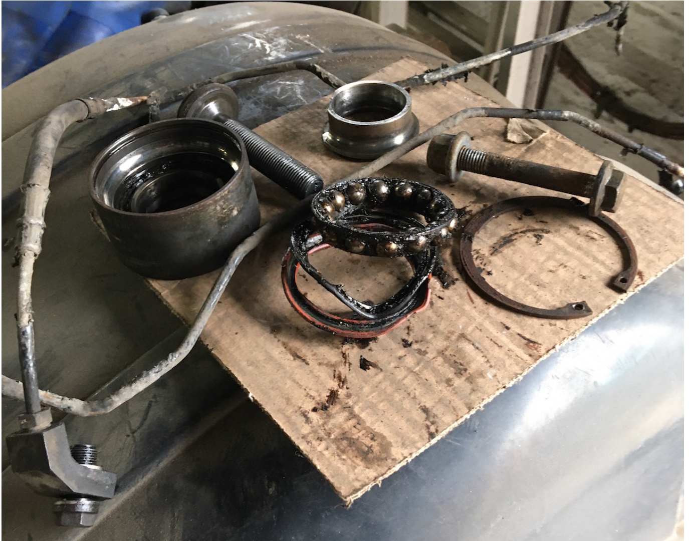
Front wheel bearing race and rear brake lines were necessary and effective maintenance items.

Next, a furry life revival for soft Alcantara finishes around steering wheel, seat cushions, gear knob and hand brake. I just could not bring back that steering rim to my satisfaction, whatever specialist treatment I tried. The underside remains unpleasantly tacky in hot weather, so it has been booked into specialists Piper Leather outside Yeovil. That meant joining a 3.5 month waiting list, such is the demand for their leather automotive and household furniture trimming services.