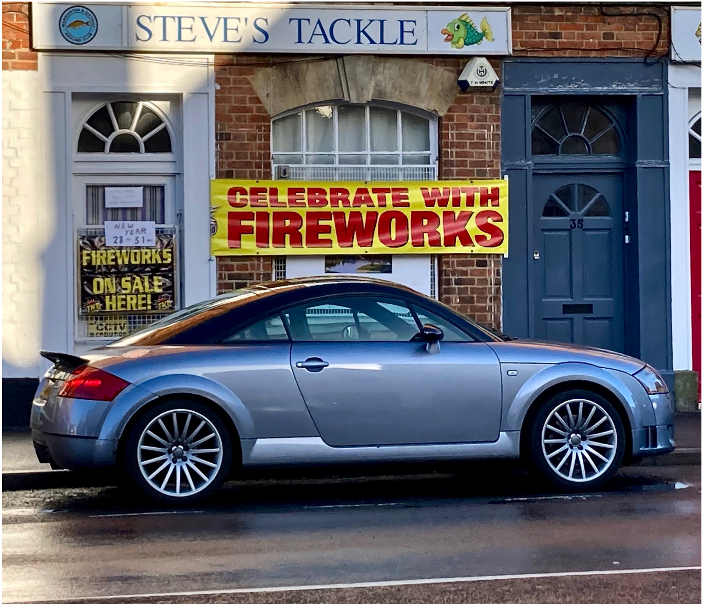
A fire-cracker on the street, but racetracks highlight strong understeer and mundane braking, even with some Brembo replacement [rather than uprated] components.

Those central red pixel readouts for the trip computer and external temperature suffer the traditional Audi TT display hiccups and missing particles, particularly when the radio is asked to report a station at the top of the display. However, the situation has worsened recently as only the red needle of the rev counter remains glowing, meaning that those for speed, water temperature and fuel tank contents are absent. That does matter at night,