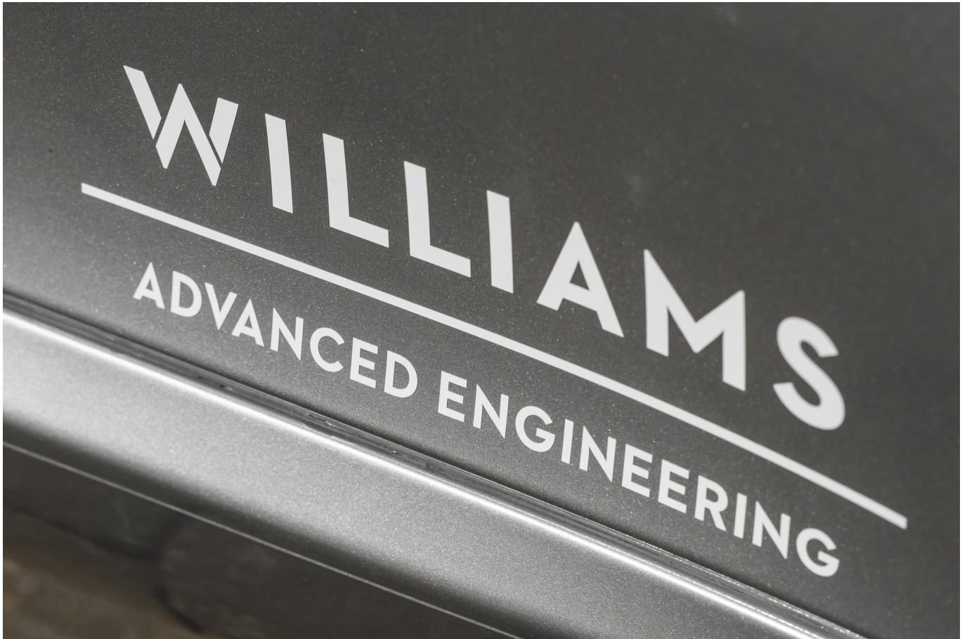
AM RapidE WAE badge.