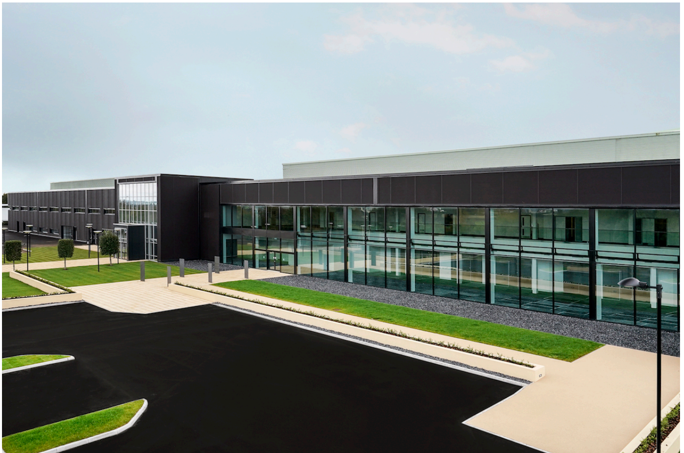
Aston Martin's St. Athan facility.

https://www.wheels-alive.co.uk/aston-martin-lagondas-new-generation-of-electric-super-cars-will-be-built-in-wales-it-confirmed-today/