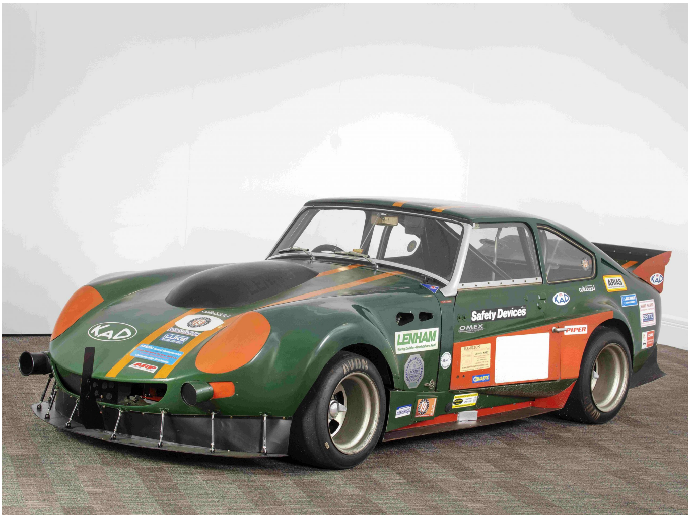
1964 Austin Healey Lenham.

The British Motor Museum has launched a brand-new scheme which allows members of the public to 'adopt' one of the cars in their collections. From the Albion A1 8hp dog cart to the Wolseley 2200 (last of line), cars that form part of the Museum's permanent collections will be available to adopt.