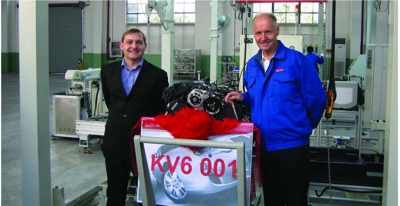
Ricardo 2010 staff with the first Chinese KV6 engine.

KV6 engine production line at Ricardo 2010's Baoshan plant in China.