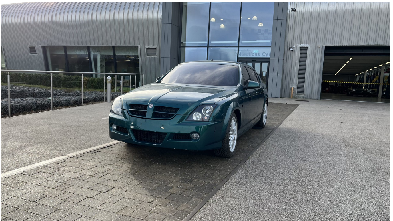
RDX60 at The British Motor Museum.

Online version: https://www.wheels-alive.co.uk/a-fascinating-insight-into-the-mg-rover-car-that-never-was-well-almost/