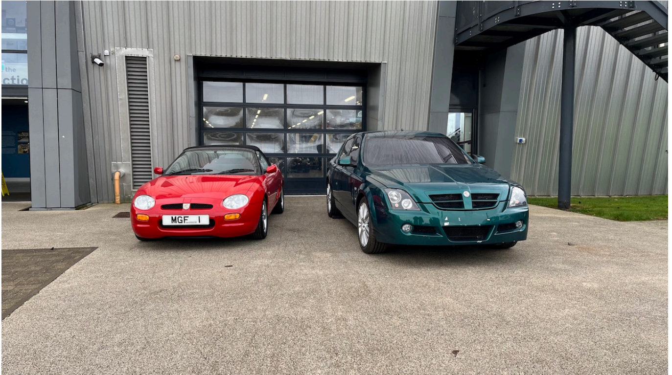
The first two historic cars (of eight) on loan from MG Rover are now at the British Motor Museum; MGF on the left and RDX60 on the right as you view this shot.