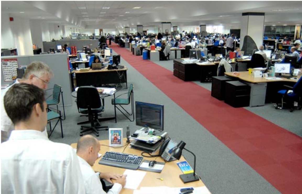
Inside SMTC tech centre.

This purchase was completed in 2007, when SAIC Motor UK Technical Centre immediately began operations.