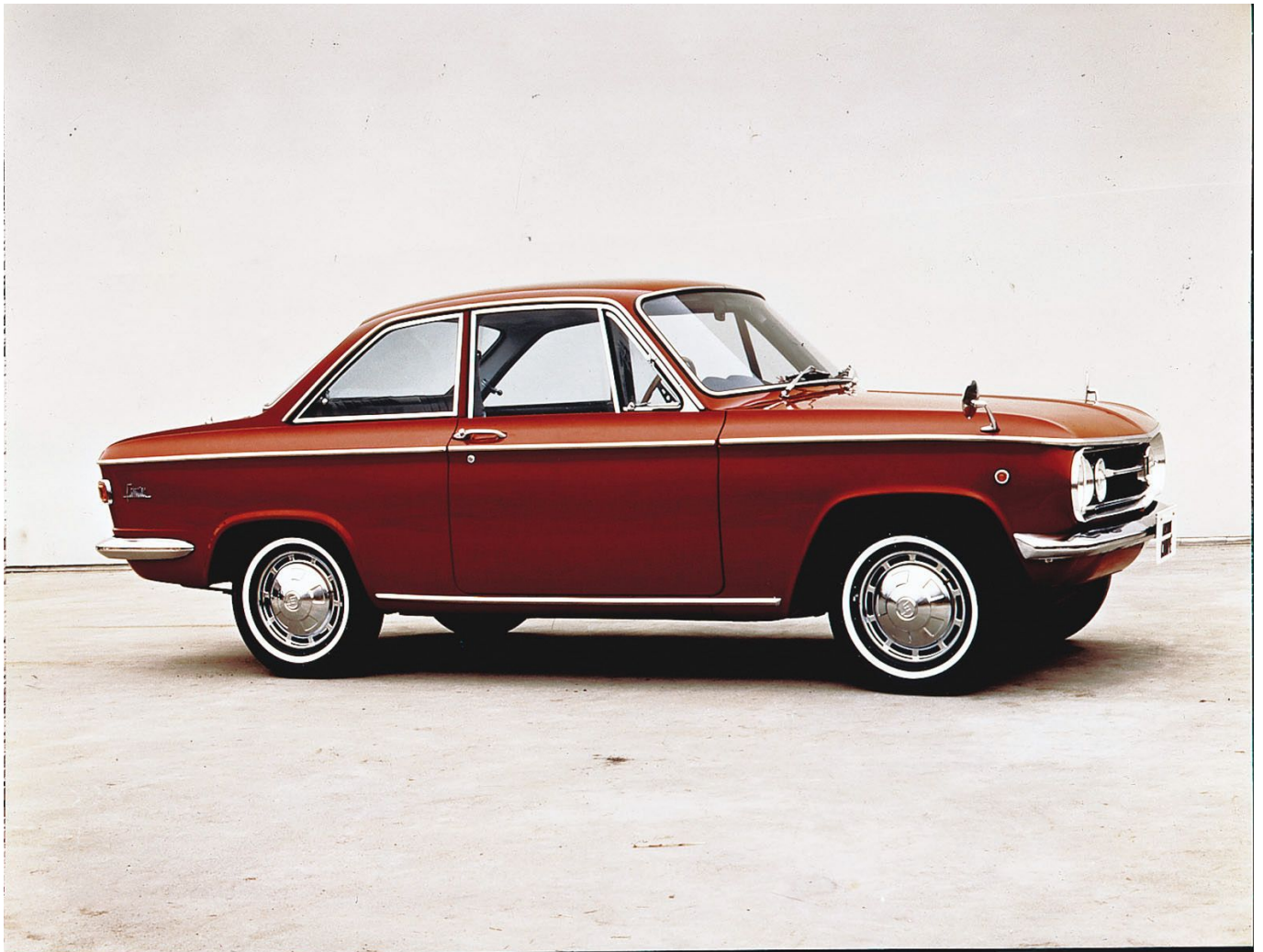
Familia Coupé 1965

with the Grand Familia/818/RX-3. Mazda took its rotary engine global with these models starting in 1968, and their Italo-design inspired looks electrified buyers, quickly driving overseas unit sales into six-figures.