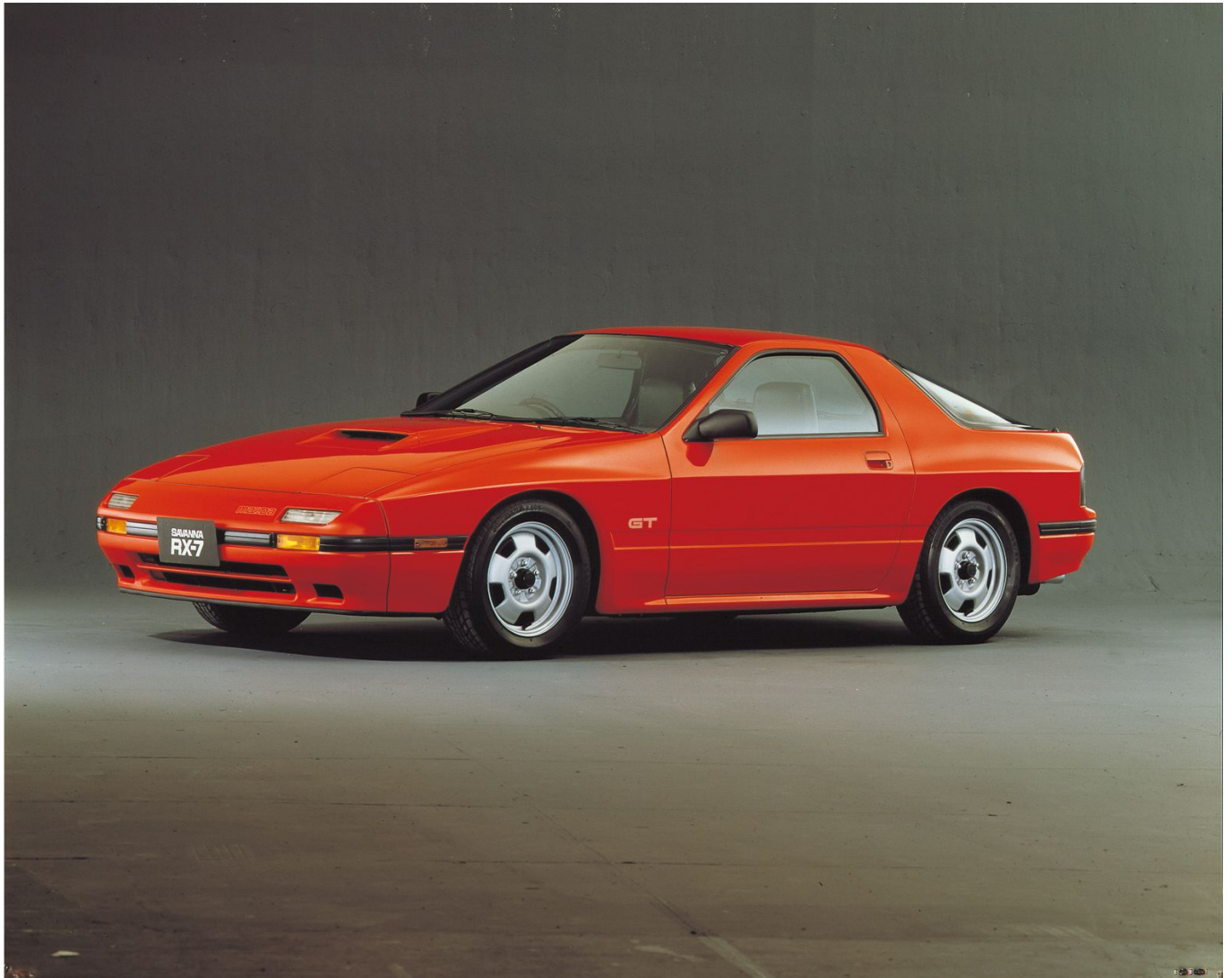
RX-7 Savanna, 1986.