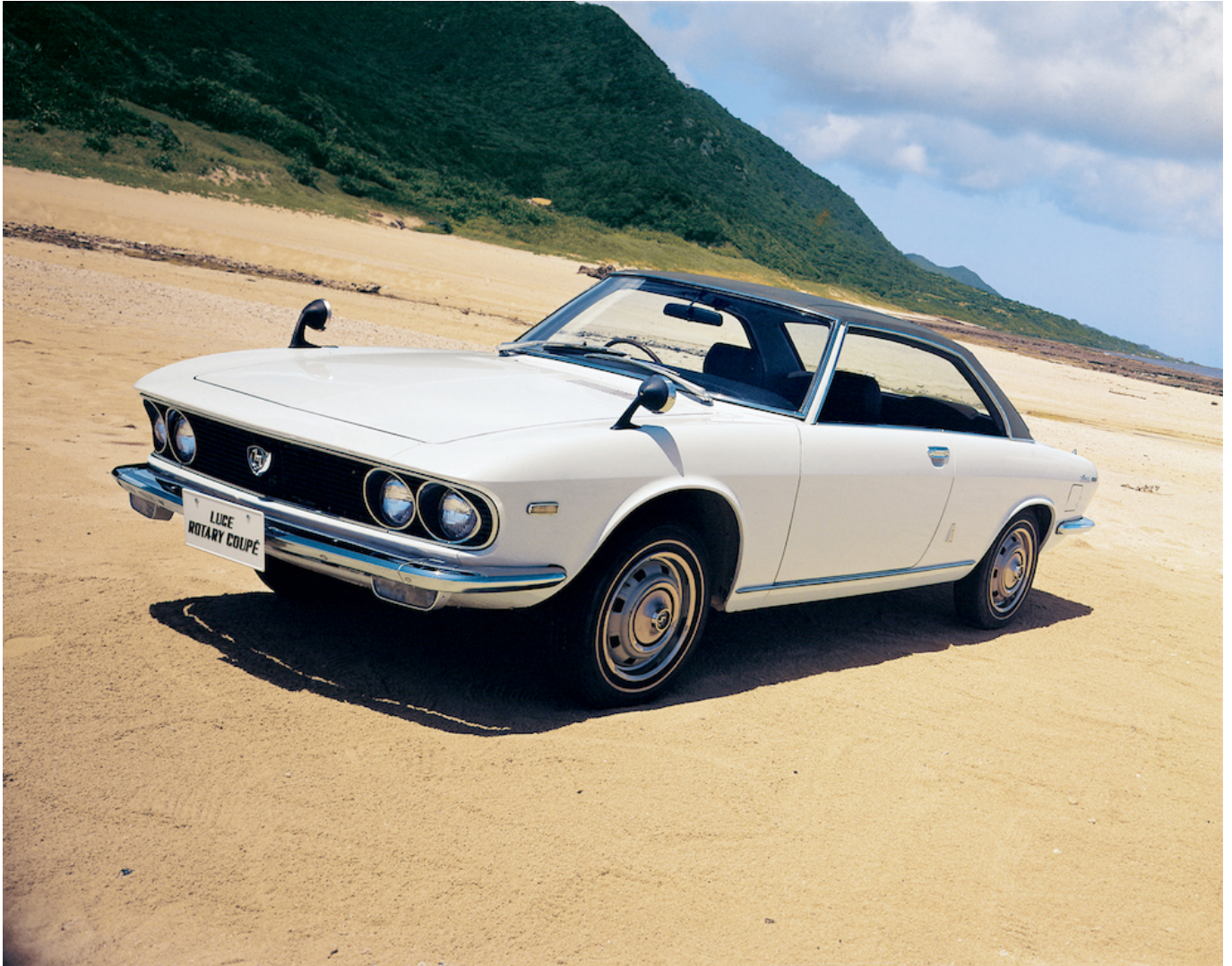
R130 Luce Rotary Coupé, 1969.

Designed at Bertone by Giorgetto Giugiaro (who had also styled the first Familia), it was Mazda's only front wheel-driven rotary model and is now a sought-after collector's item. Slotted above the RX-2 and RX-3, the Luce R130 would make way in 1972 for the Mazda RX-4. Marketed as luxurious and sporty, the hardtop coupé version was available with an "AP" (anti-pollution) rotary that improved emissions and fuel economy. The engine would also see service on the RX-3 and Mazda Cosmo/RX-5 launched in 1975 in coupé and fastback format. Performance of the 110-135 PS rotary RX coupés, with kerb weights in the 900-1,100 kg range, was very respectable for the time.