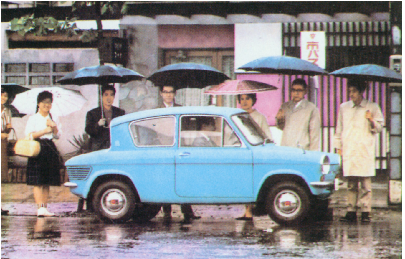
Carol 360, 1962.

launch. The Mazda Carol P360 coupé, which had a longer wheelbase and a four-cylinder engine, joined the line-up in 1962 with comparable success.