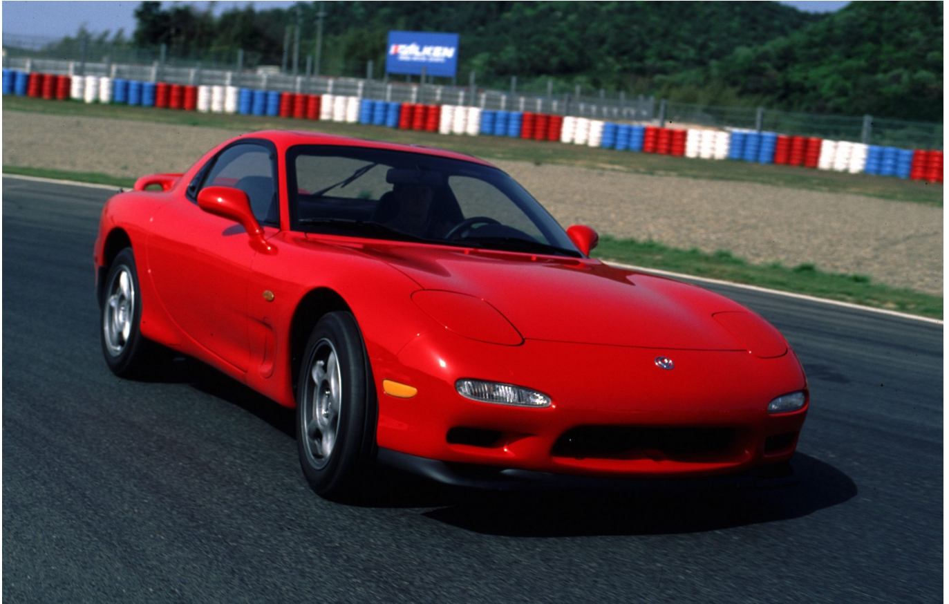
RX-7 third generation, 1992.

Less well known is the Eunos Cosmo, a Japan-only luxury sports coupé built from 1990 until 1995. It was the only production model with a three-rotor engine; the 300PS twin-turbo “20B-REW” was also the largest-ever production rotary. The Cosmo introduced many new cutting-edge technologies, like the first built-in GPS navigation system and a touchscreen display. Another domestic market model, the Autozam AZ-1, was remarkable in its own way. Weighing only 720 kg, the exciting mid-engined kei coupe developed under Toshihiko Hira, MX-5 programme manager, had gullwing doors and a 9,000 rpm redline – in a segment personified by utilitarian “boxes on wheels”.