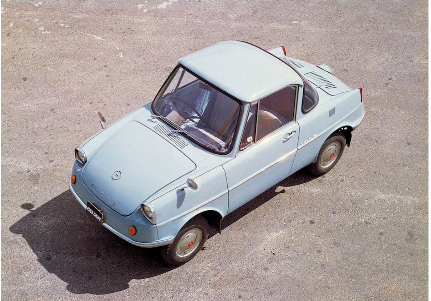
R360 coupé, 1960.