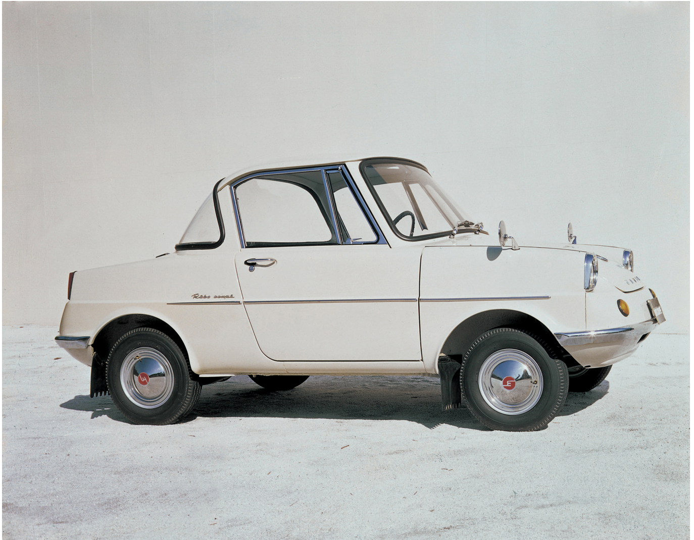
R360 coupé, 1960