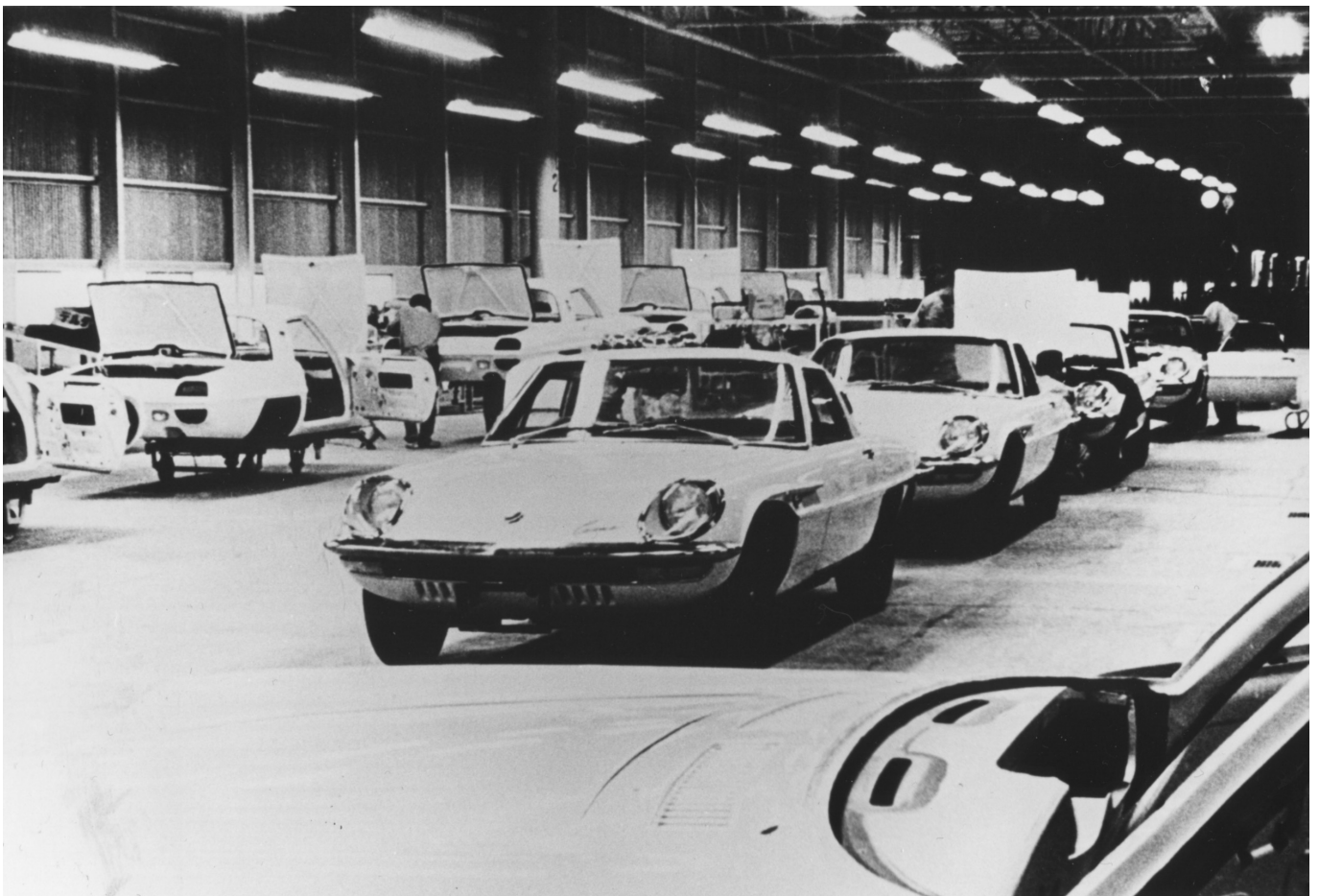
Mazda Cosmo Sport 110S, 1968

Online version: https://www.wheels-alive.co.uk/100-years-of-mazda-and-60-years-of-their-two-door-coupes/