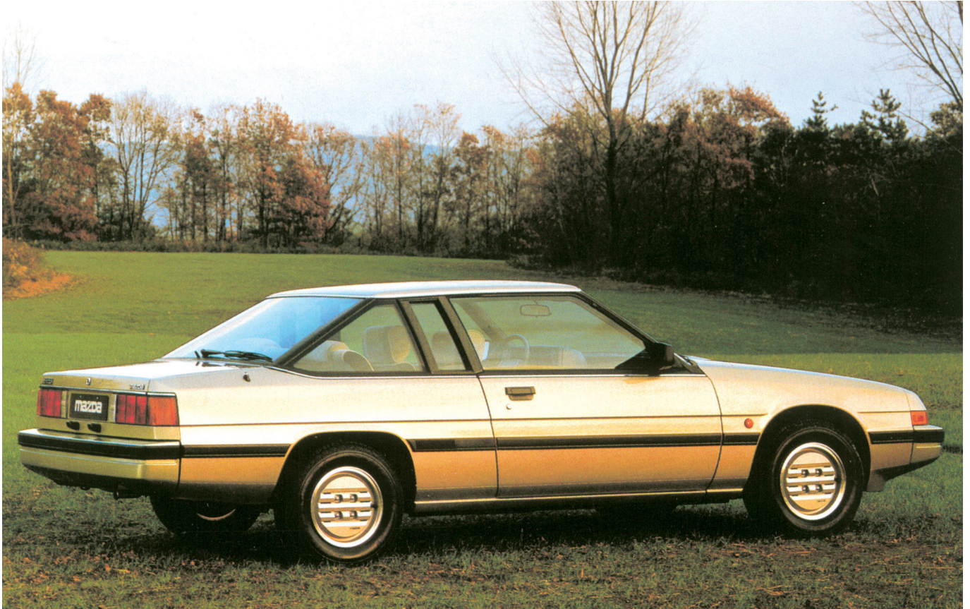
929 Coupé, 1982.

The stylish Mazda MX-6 (1987-97), meanwhile, had optional four-wheel steering. And the compact Mazda MX-3 (1992-98) was available with the 1.8-litre K8 engine, the world's smallest mass-production V6.