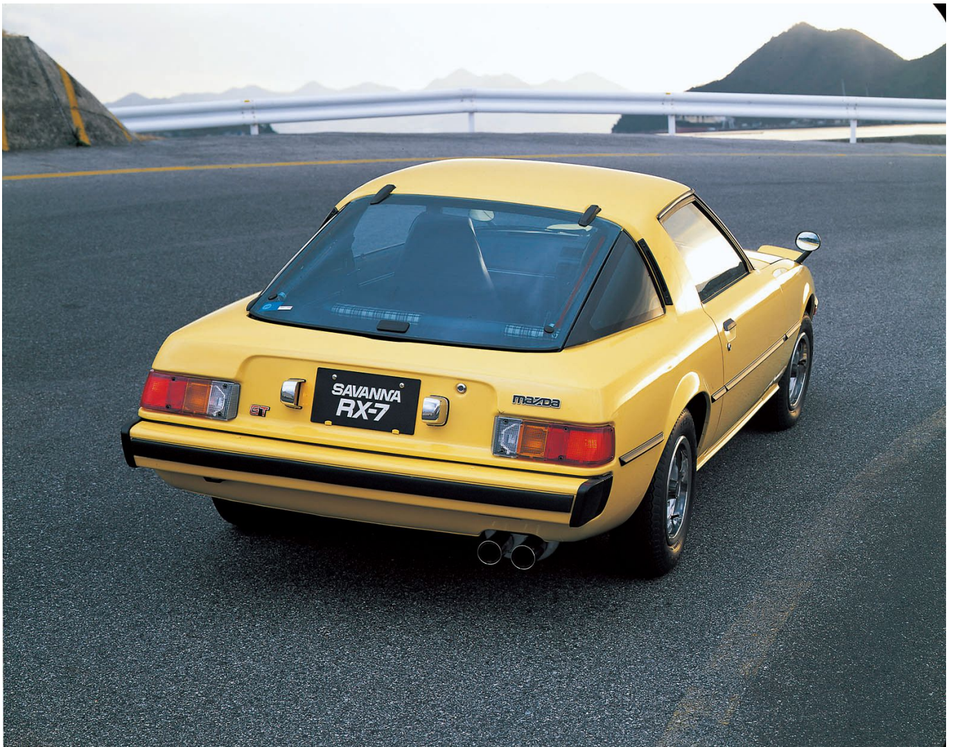
RX-7, first generation, 1978.

The Hiroshima carmaker took this recipe for driving fun up a level in 1978 with the Mazda RX-7, whose unique wedge-shaped design featured a wraparound glass rear window. Under the bonnet of Mazda's first truly mass-market sports car was a completely redesigned rotary engine. Propelling a lightweight structure with near-perfect weight distribution, it was exceptional to drive. Successful on the racetrack and rally stage, the RX-7 developed over three model generations into a high-performance twin-turbocharged super-coupé on par with the best the competition had to offer. With some 811,000 produced, the RX-7 remains the most popular rotary powered car in history.